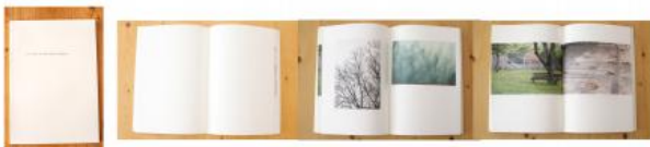
On a Clear Day Nothing Ever Happens, 2020 Artist Book, 21x30cm, 52 pages