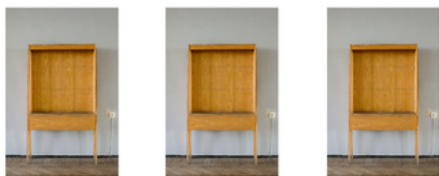
where is everybody, 2018 Digital C-Print, 70x45cm