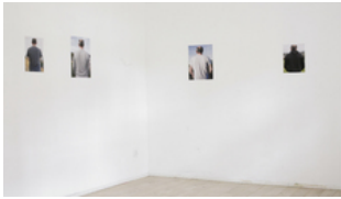
A Walk, 2016 Digital C-print, variable