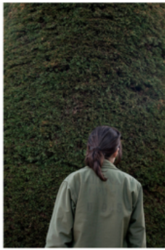
Untitled, 2016 Digital C print, 40x60