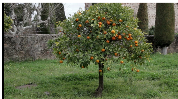
mandarin tree, 2017 30 sec video loop