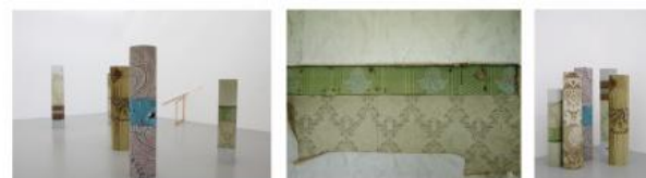
Hotel Iveria, 2020 Inkjet Prints, dimensions variable 100x177