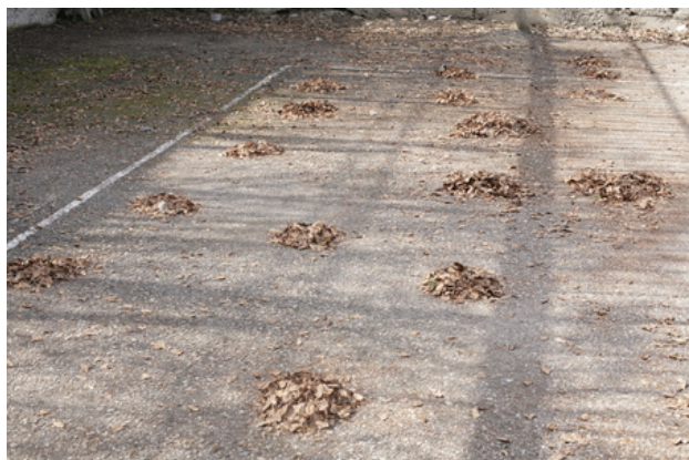
practising landscape, 2018 digital c print, 54x36