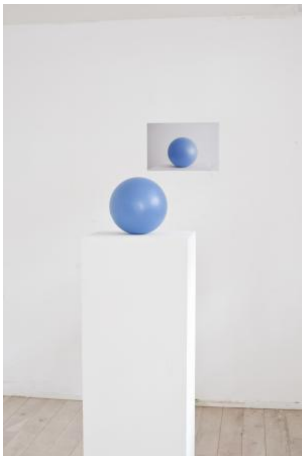
Untitled, 2020 Lambda Print, resin, a stand, 40x60cm