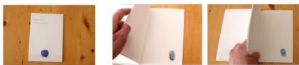
Adam and Eve (Corraborating Evidence), 2021 Artist Book, 18.5cm x 13cm, 32 pages