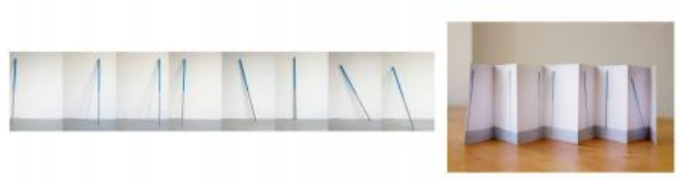
Restless, 2019 Leporello book (folded), Leporello book (folded) 20cm x 13cm, 7 images