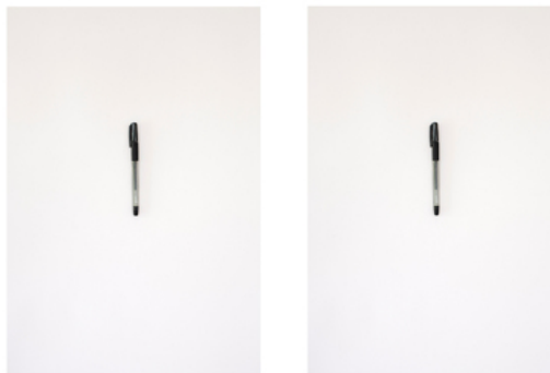
Black and Red, 2018 digital c print, 60x40