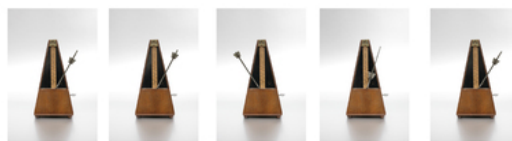
Green Ray, 2017, lambda prints, composed of 5-7 images, 70x54