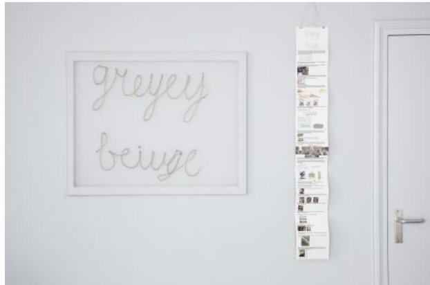
Greyey Beige, 2023

Riso print on folded Japanese paper, 84x118 cm