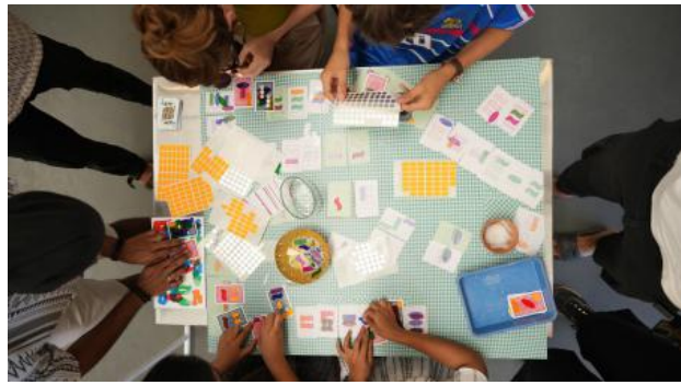
DESET! x Museum of Goa, 2024

inside: riso, cover and sleeve: silkscreen, 27 x 16 x 0,7 cm