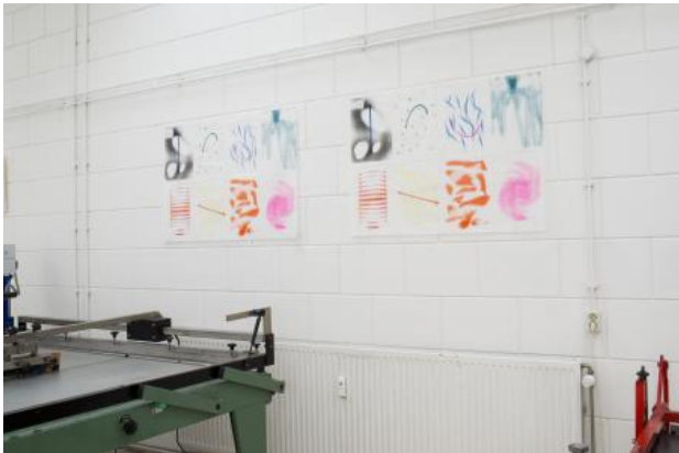
Freedom/Effort (riso), 2023

Silk, heat transfer foil, metal, resin, wax in cotton wool and shoes, 190 x 85 x 43 cm