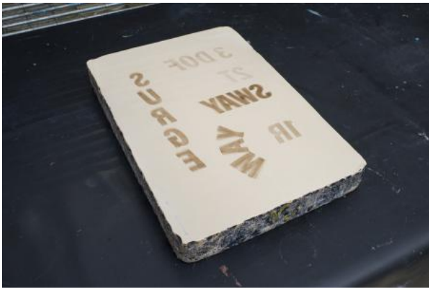
3DOF 2T1R (Rigid body moving through space), 2023 Tusche on Lithostone, 54x38x7 cm