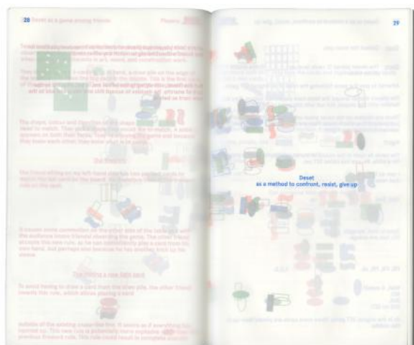
DESET!, 2024 inside: riso, cover: silkscreen, 27 x 16 x 0,7 cm