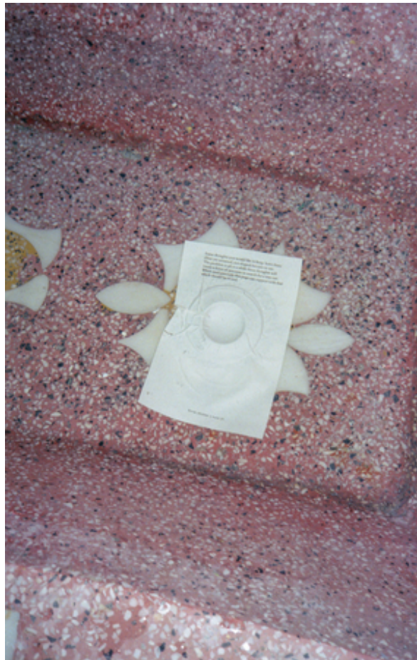
Room around a page, documentation exhibition A-DASH, installation, sink detail, text, Athens, Greece, 2019