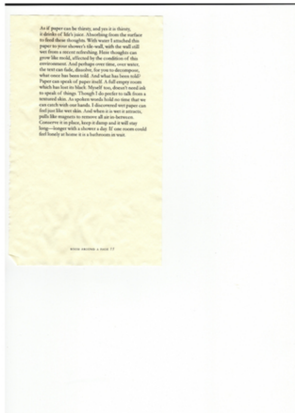
Spaces for places, documentation scan object 1, print, text, gesture, The Hague, The Netherlands, 2020