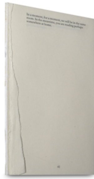
The space in between, documentation booklet by Onomatopée, 110 mm 180 mm, writing, print, gesture, Eindhoven, The Netherlands, 2019