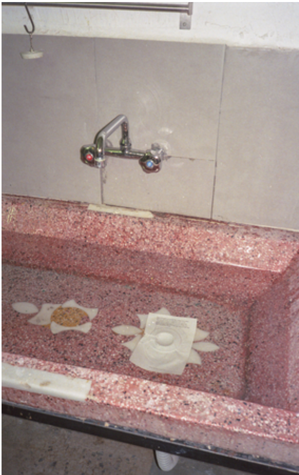
Room around a page, documentation exhibition A-DASH, installation, sink overview, text, Athens, Greece, 2019