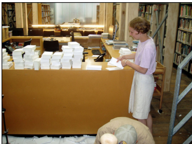
The space in between, documentation performance in library by Hans de Groot, The Hague, The Netherlands, 2018

2017 - Guided tours in Voorlinden sculpture 2018 garden www.voorlinden.nl/tuinen/beeldentuin-clingenbosch/