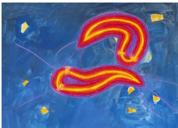
gotas, 2024 colour pencil on paper, 34 x 62 cm