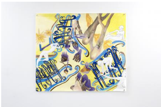
Transforming into what?, 2024 colour pencil on paper, 80.5 x 69.5 cm