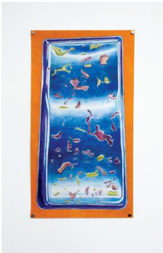
gotas, 2024 colour pencil on paper, 34 x 62 cm