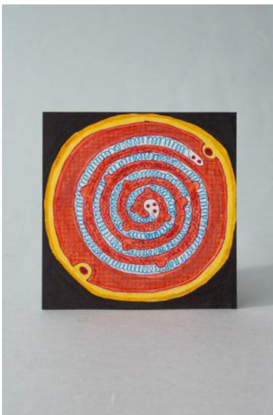
Untitled, 2024 pencil and marker on paper, 10 x 10 cm