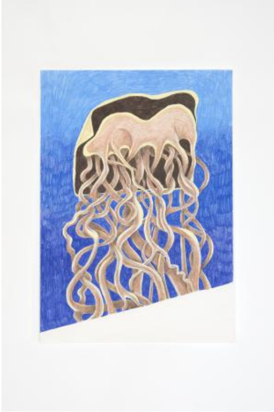
, 2024 colour pencil on paper, 29.7 x 42 cm