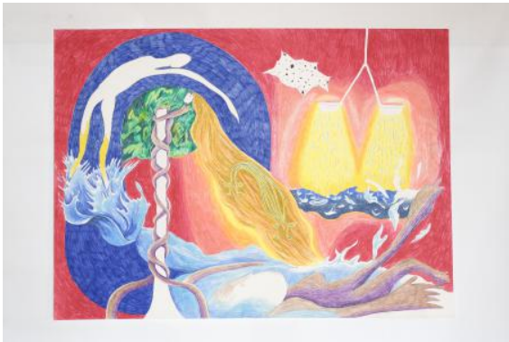
untitled, 2024 colour pencil on paper, 118.9 x 84 cm