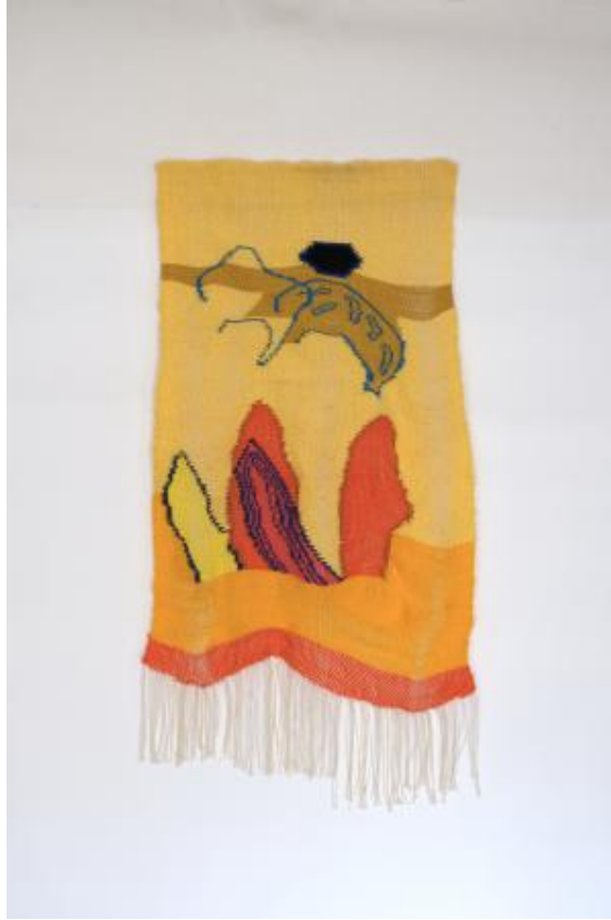
untitled, 2024 weaved cotton & wool, 47 x 77 cm