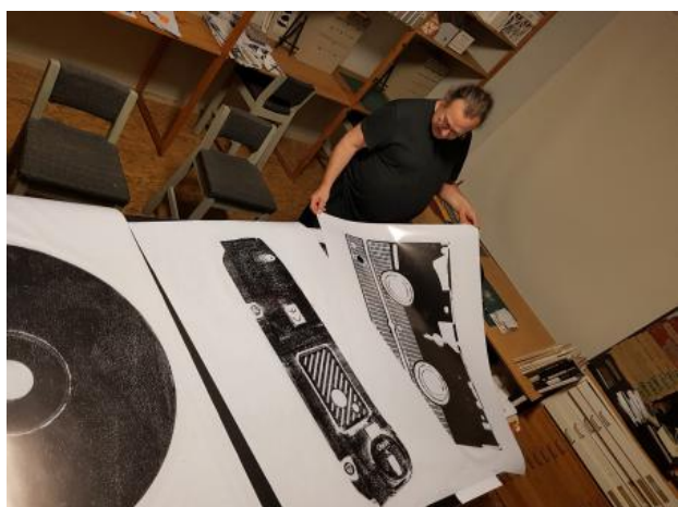
, 2018 Relief prints of e-waste, A0