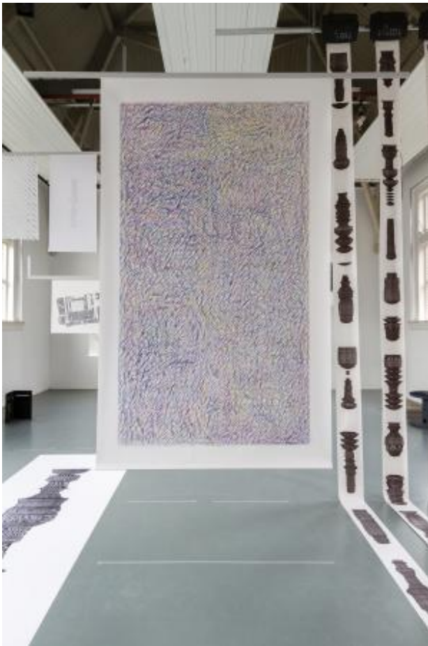
U3, 2021 Beeswax crayons on paper, 260x150 cm