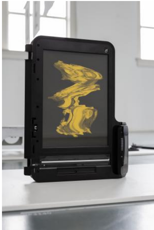
VP3140, 2021 Laser print on paper framed in scanner unit, 10 x 35 x 45