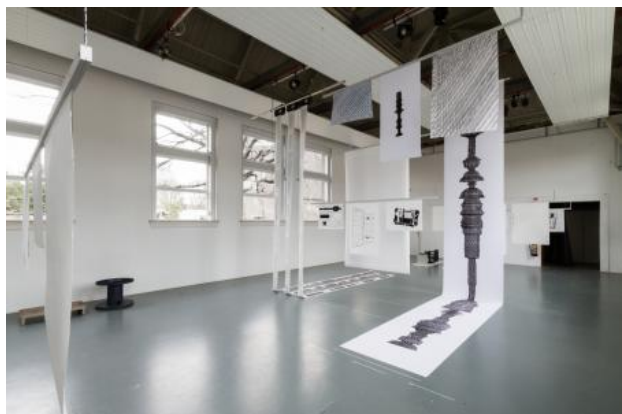
Omnipresent, 2021 solo show