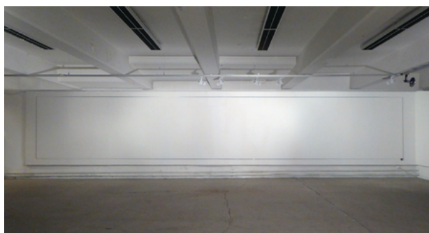
445" Class (445" Diag.) - 7:1 - Ultra Quantum Dynamic - White, 2017 Installation on the wall with a DV-tape and four nails, 445 inch diagonally