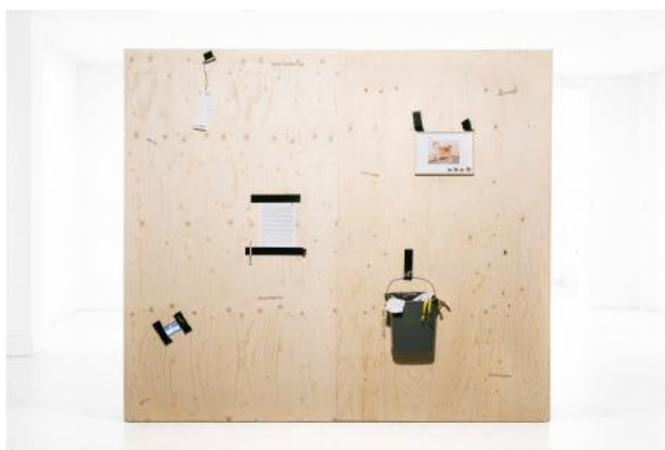
I OWNED THIS DOG BEFORE ELON WENT CRAZY, 2025, research, mix-media installation, video, tape, images, text, wood, plastic, and banana, artist 'Open Studio', FRANKS, Oslo

Jungle TV, 2025 mix-media installation, film, sculptures, lightboxes, found material, and object