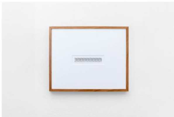
Last Five!, 2024, 20 x 30 cm, wooden frame, museum glass, illustration, exhibition "Nightshift", Heden, The Hague

5475 Grams, 2024 mix-media installation, loop, 17:45', SD, video, smoke, wooden frame with illustration, glass frames with found images, weedbags, glass, and smoking papers