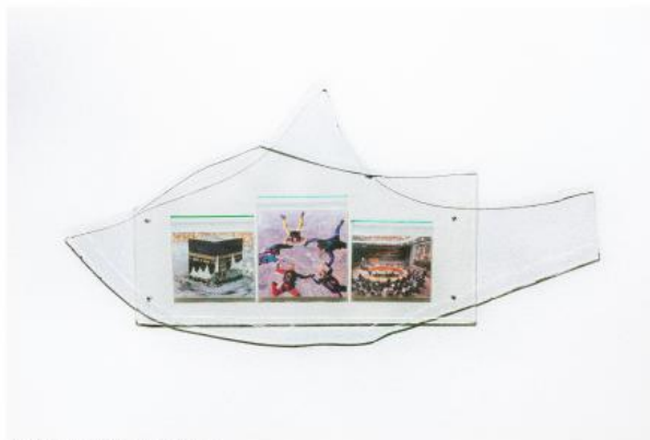
1002 Grams, 2024, 20 x 10 cm, glass, nut and bolt, weedbags, found images

2016 - Chair Participatory Council at the Royal 2018 Academy of Art, The Hague