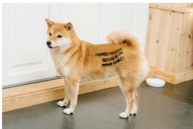
I OWNED THIS DOG BEFORE ELON WENT CRAZY, 2025, images, natural paint on shiba

Around Europe, 2025 mix-media installation, photography, archive images, and bar gates