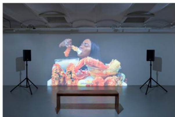
I Am Lobster, screening installation, 16:29' minutes, HD, single-channel video, Quantum, The Hague, 2023 In collaboration with Pined Polyzoid and The Lobster Lobby

Video installation, 16:29' minutes, HD, single-channel video