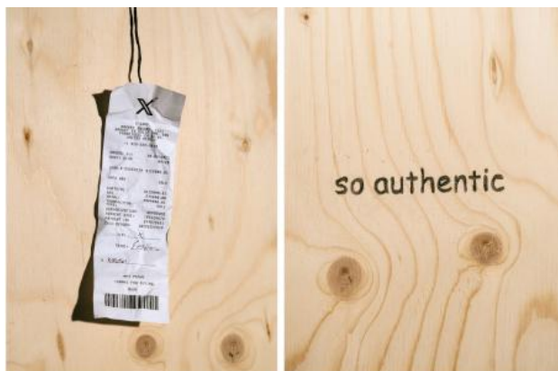
Presentation view of 'Open Studio', FRANKS, Oslo

I OWNED THIS DOG BEFORE ELON WENT CRAZY, 2025