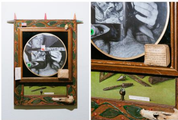
Dirty Days, assemblage with images and found objects, duck skull, incense, brass, glass, bandage kit, double wooden frame, 36 x 42 x 5 cm, 2024

Assemblage on Maya code boardgame, burned matches frame, 47 x 87 x 4 cm