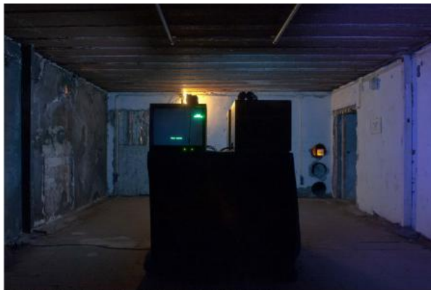
Jungle TV, 2025, mix-media installation, film, sculptures, lightboxes, found material, and objects, exhibition 'Jungle TV' Het Doorn, The Hague

2016 - Chair Participatory Council at the Royal 2018 Academy of Art, The Hague