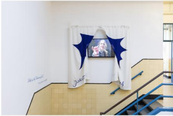
Is This What I Want? video essay, 7:32' minutes, HD, mixed media installation, 2018