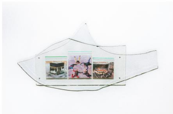
I OWNED THIS DOG BEFORE ELON WENT CRAZY, 2025, 20 x 100 cm, glass, nut and bolt, weedbags, found images

I OWNED THIS DOG BEFORE ELON WENT CRAZY, 2025 research, mix-media installation, video, tape, images, text, wood, plastic, and banana