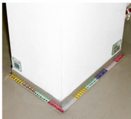
Exhibition view at "Nightshift", Heden, The Hague

1002 Grams, 2024 glass, nut and bolt, weedbags, found images, 55 x 28