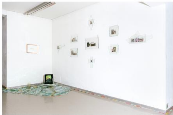
5475 Grams, 2024, mix-media installation, loop, 17:45', SD, video, smoke, wooden frame with illustration, glass frames with found images, weedbags, glass, and smoking papers, exhibition "Nightshift" Heden, The Hague

2018 Stroom KABK Invest Program Stroom The Hague, Netherlands