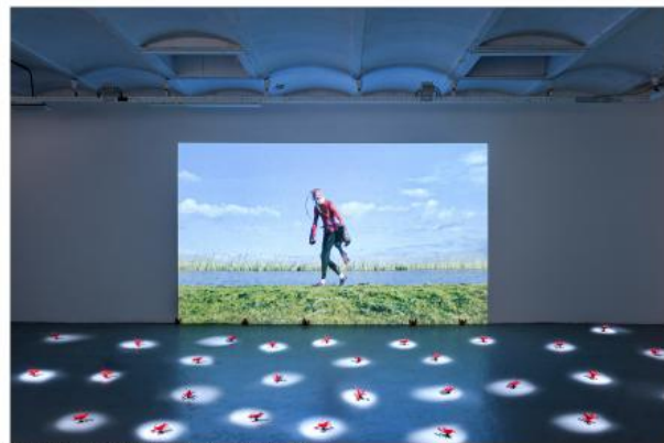
I Am Lobster, video installation, 16:29' minutes, HD, single-channel video, Quantum, The Hague, 2023 In collaboration with Pined Polyzoid and The Lobster Lobby

Assemblage with images and found objects, duck skull, incense, brass, glass, bandage kit, double wooden frame, 36 x 42 x 5 cm