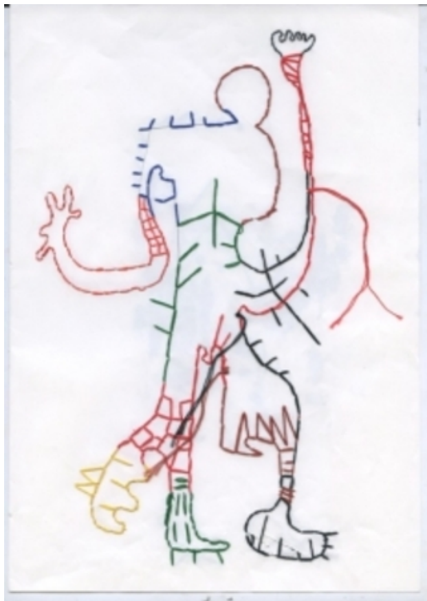
Human, 2018 Embroidery on Paper, 20 x 29 cm