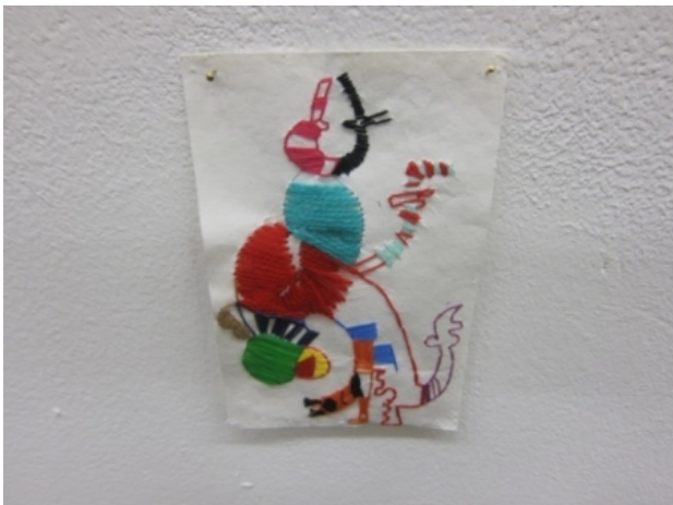
Untitled, 2018 Embroidery on Paper, 11,5 x 18 cm