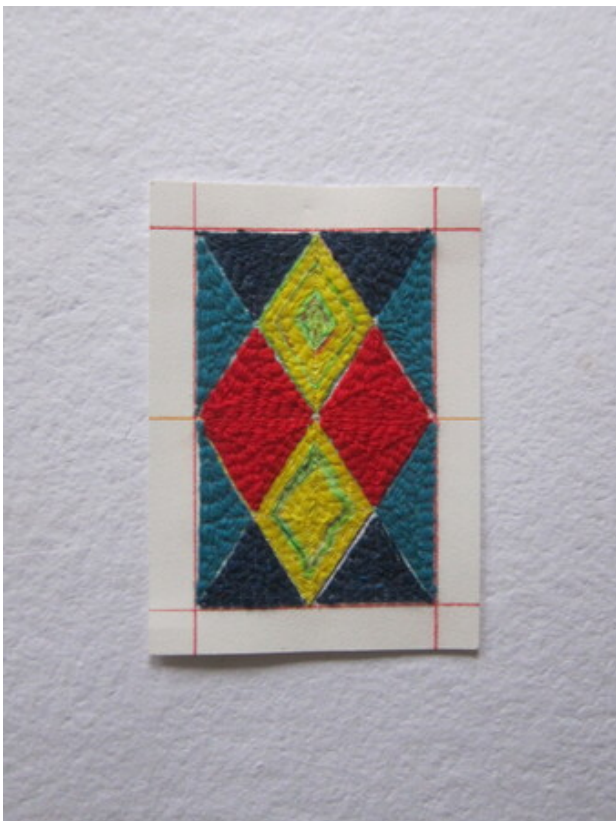
Untitled, 2020 Wool on Paper, 21 x 14,8 cm