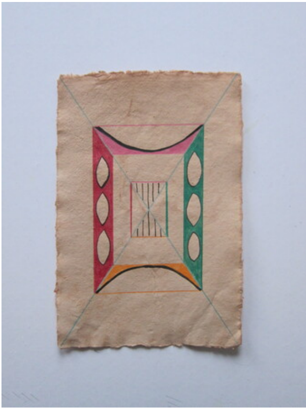
Untitled, 2020 Colouring Pencil and Ink on Paper, 24 x 36 cm