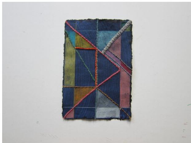
Untitled, 2020 Wool and Colouring Pencil on Paper, 24 x 36 cm