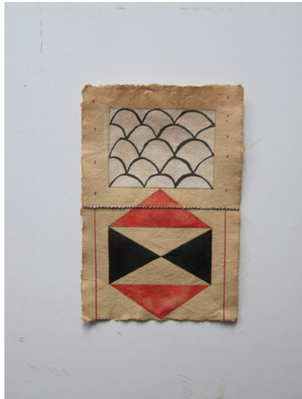
Different Worlds Comin Together, 2021 Ink, Watercolour, Colouring Pencil and Wool on Paper, 24 x 36 cm