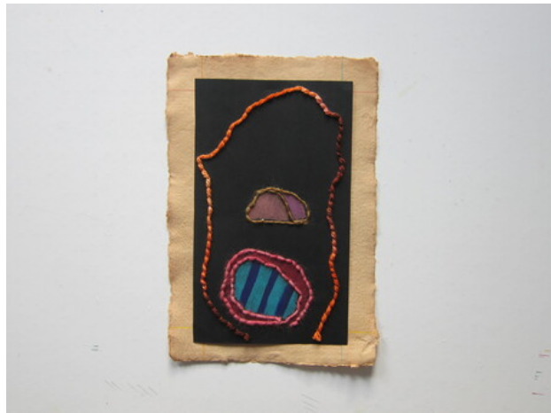
Untitled, 2020 Wool and Colouring Pencil Paper Collage on Paper, 36 x 24 cm