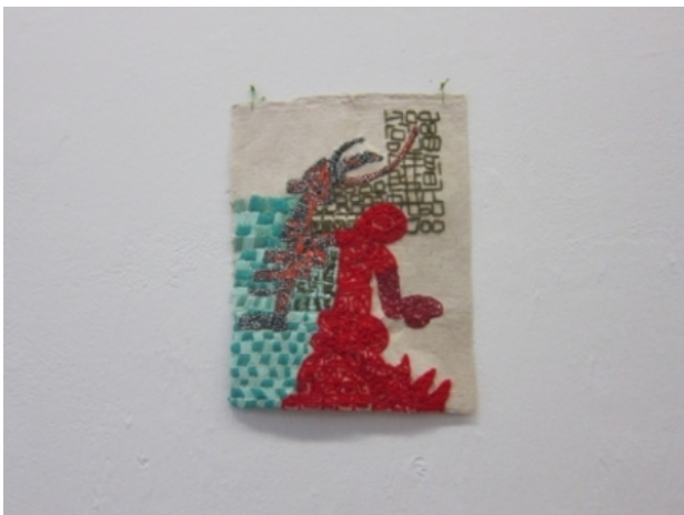
Untitled, 2018 Embroidery on Paper, 20 x 26 cm