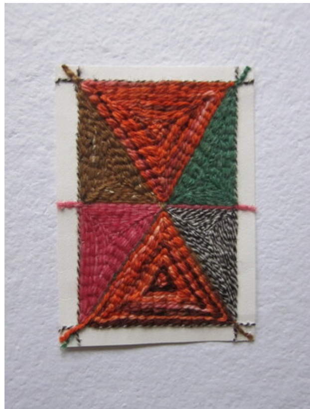
Untitled, 2020 Wool on Paper, 21 x 14,8 cm