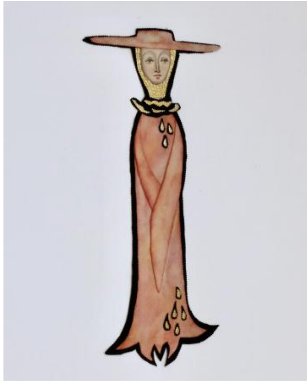
An Unknown Order, 2025 felt, watercolour, aluminium, 70x17cm