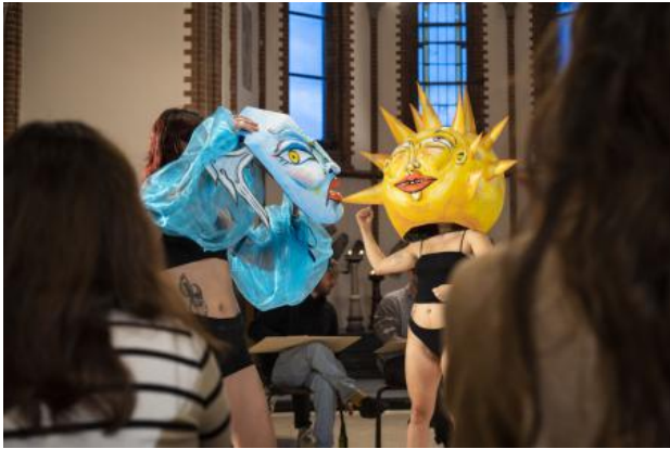
The North Wind and the Sun, 2023 paper mache, fabric, n/a