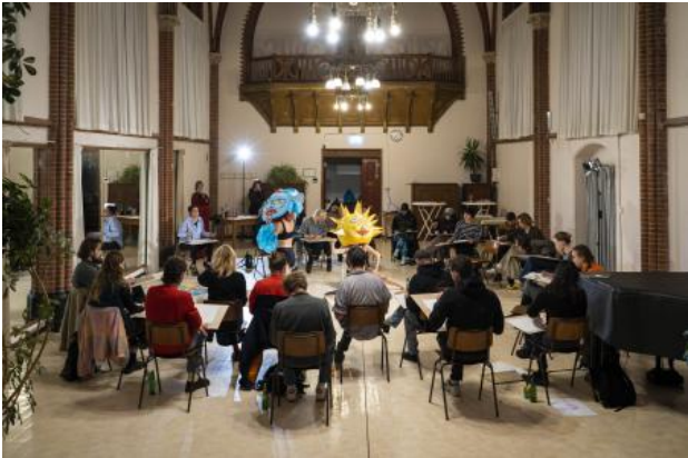
The North Wind and the Sun, 2023 paper mache, fabric, n/a