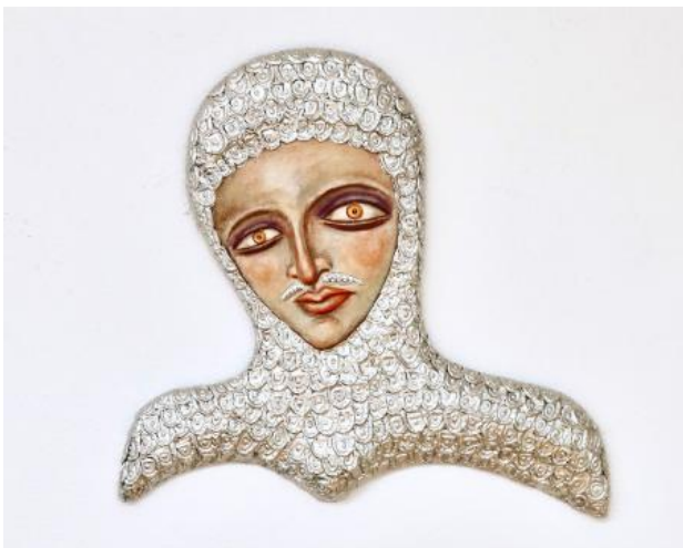
You will observe the rules of battle, of course?, 2024