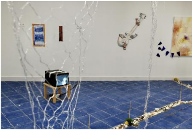
Greasing the Planets, 2024