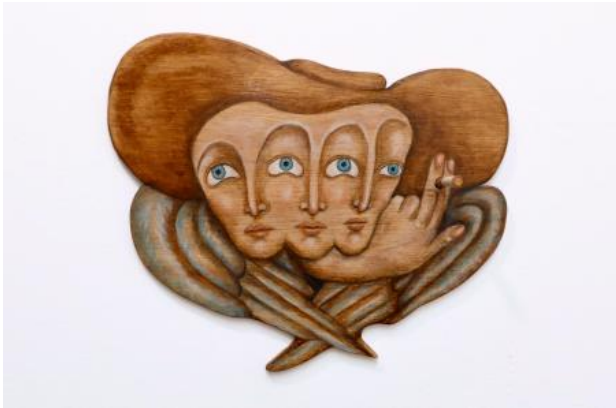
Stake Out, 2025 wood, wood stain, watercolour, varnish, 30x40x8cm