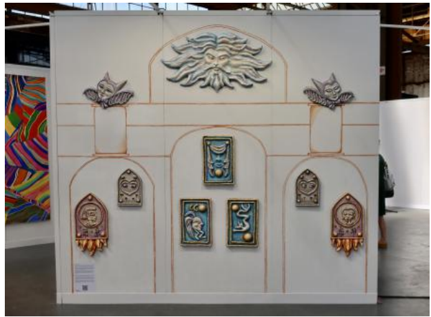
Temp. Temple, 2023