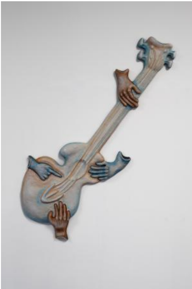
Ongoing Entertainment Project (Touch Vibration), 2024