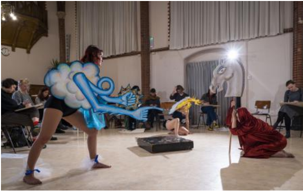
The North Wind and the Sun, 2023 paper mache, fabric, n/a