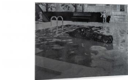
Imitation of Life (5/5), 2023