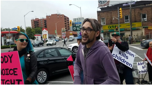
Ultraviolence, 2022 03:39