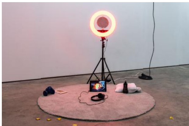
Ultraviolence, 2023 video installation

2018 Nominated KABK Master Artistic Research Award Netherlands