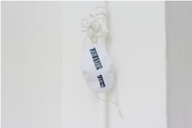
New Dark Age, 2021