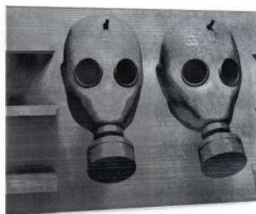
Imitation of Life (1/5), 2023