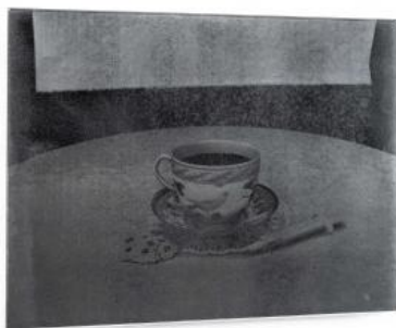
Imitation of Life (4/5), 2023