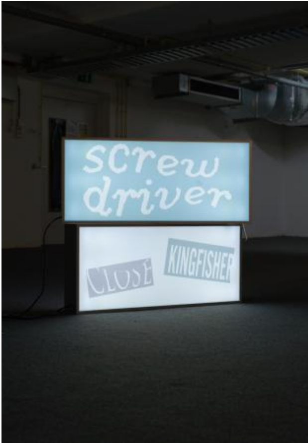
Black Box Society, 2021