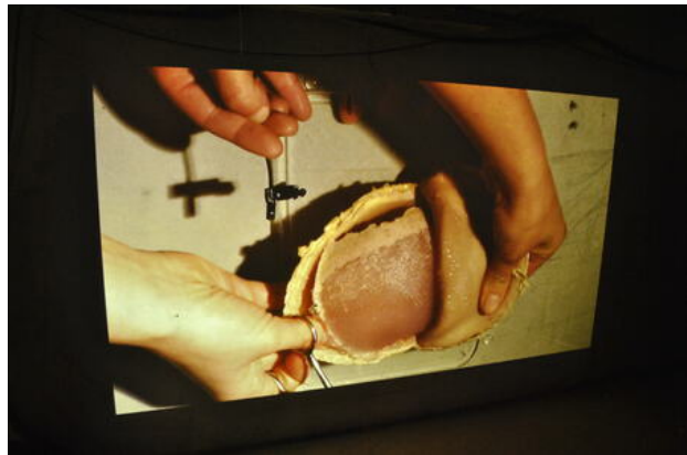
Disruptions, 2019 Performance, 15 minutes