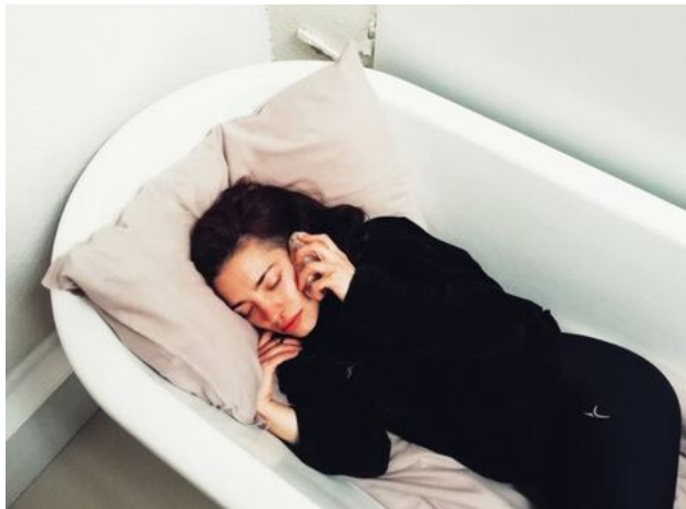
Hideouts for the Body, 2018 Text, sound recording, installation, 450x 400