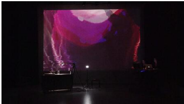
In-Corpore, 2019 Audio visual performance