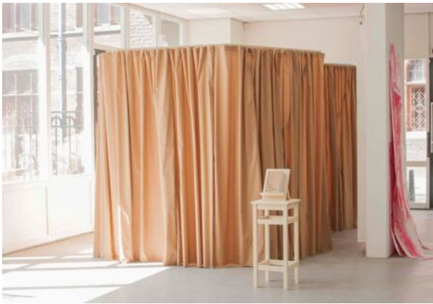
We Are All Ears, 2018 Writing, graphic design, risoprint, A5