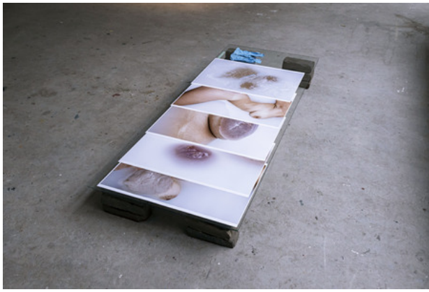
Soft Shucks, 2020 Photography