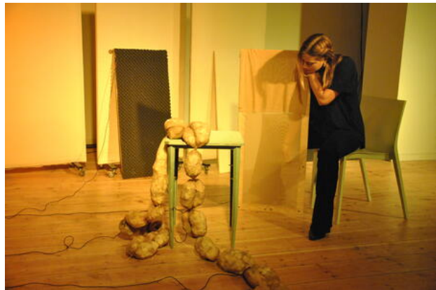
Touches, 2018 Contact microphones, foam, lycra, 500x300