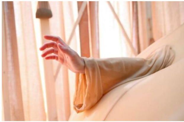
FOAM: The Listening Body, 2018 Sewing, design, sculpture, installation