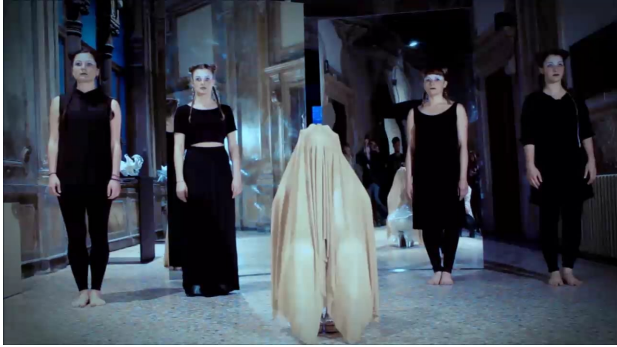
Mirror Poser x Creased, 2016 03:51