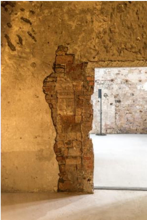
You Do Not Remember Yourself, 2022 Brass, transducers, 6x1m