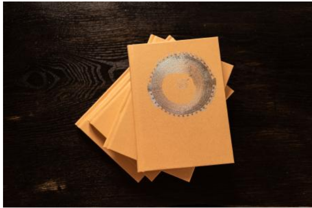
The Book of Gharīb, 2022