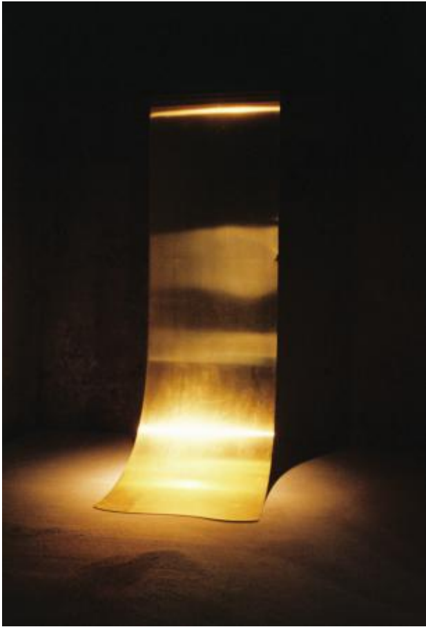
You Do Not Remember Yourself, 2022 Brass, transducers, 6x1m

2015 - Master Artistic Research, Royal 2019 Academy of Arts, The Hague - guest tutor