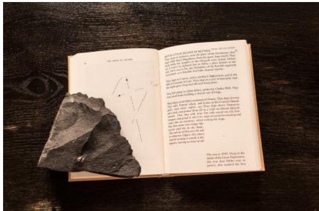
The Book of Gharīb, 2022