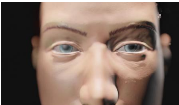
The Irresistible Powers of Silent Talking, 2021 installation