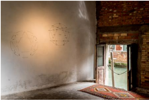
Seven Common Ways of Disappearing, 2022 record player, vinyl, speakers, fresco, lights