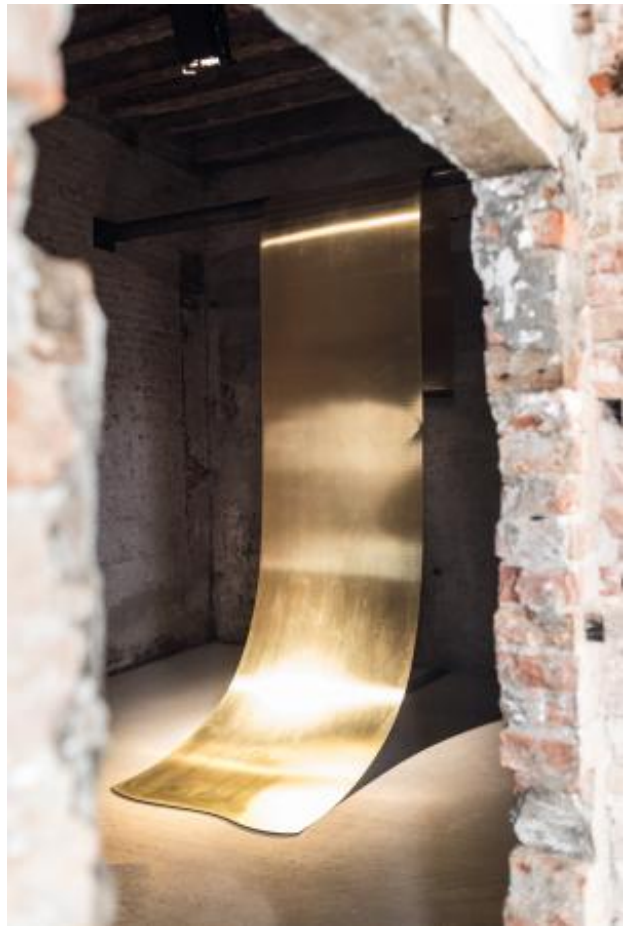
You Do Not Remember Yourself, 2022 Brass, transducers, 6x1m