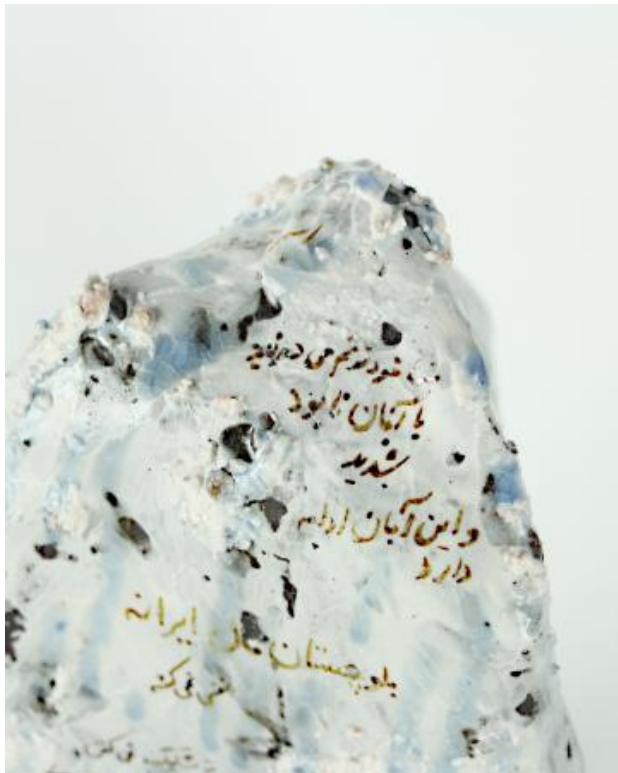
My Alborz, 2023 Stoneware ceramic, 20x20x43