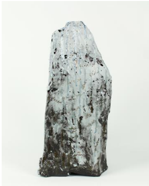
My Alborz, 2023 Stoneware ceramic, 20x20x43