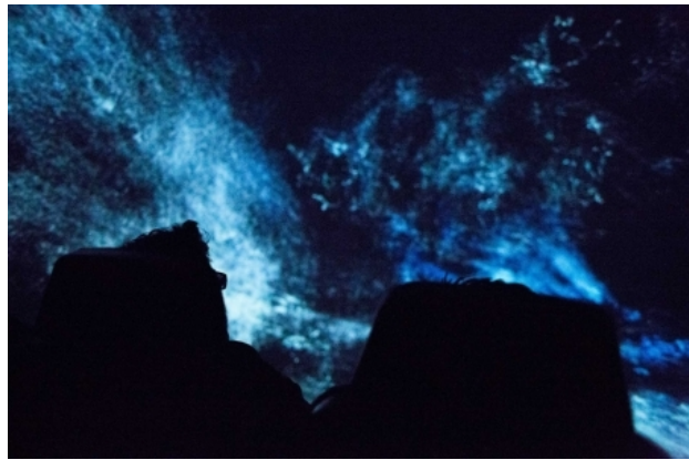
Remote Sense, 2017 Audiovisual, Full Dome