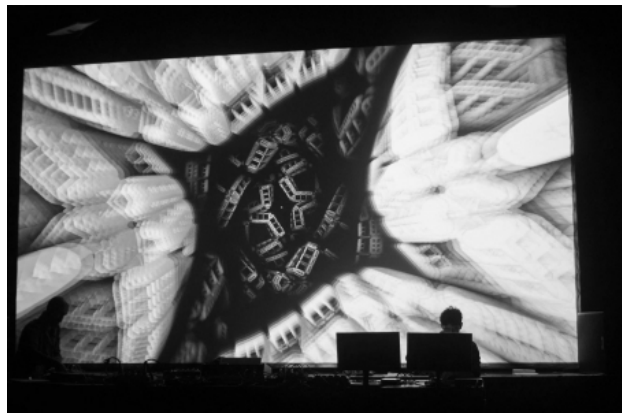
Ngons, 2016 Audiovisual, 1080