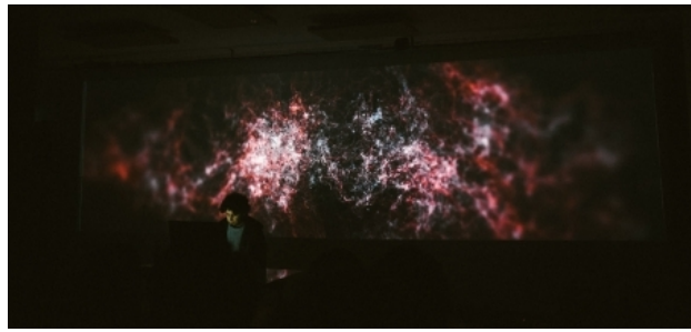
Topologies, 2017 Audiovisual, 1080