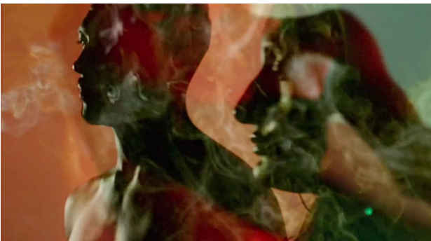
Teaser Anushthan - a decolonizing ritual , 2019 1:39