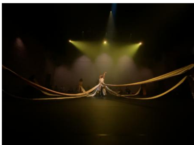
Legacy & Seeds, 2024

2013 - -- Cultural organiser at CLOUD/danslab On-going