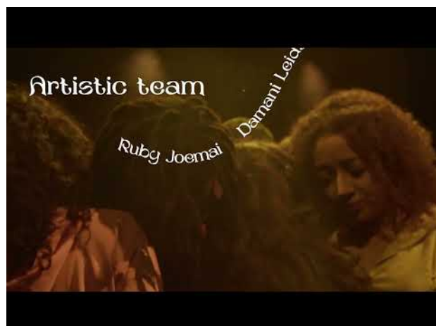
Fertile Ground / , 2023