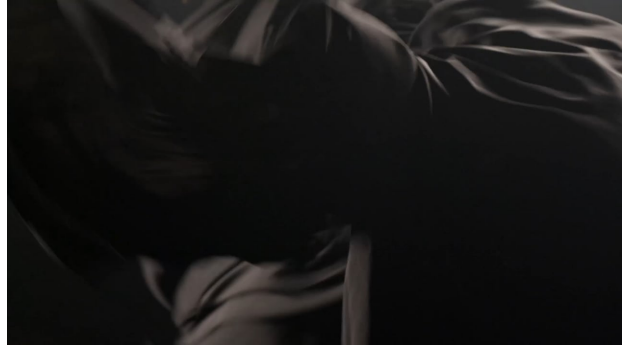
ANALEMMA a decolonizing club dance ritual centering queer people of color , 2021