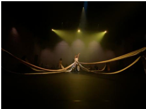
Legacy & Seeds, 2024

2013 - -- Cultural organiser at CLOUD/danslab On-going