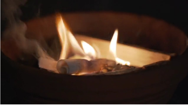
UMAD decolonizing rituals aftermovie, 2020 8:14