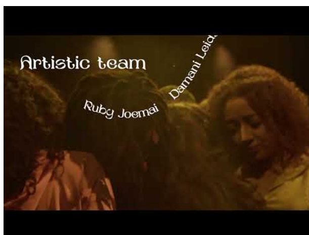
Fertile Ground / , 2023