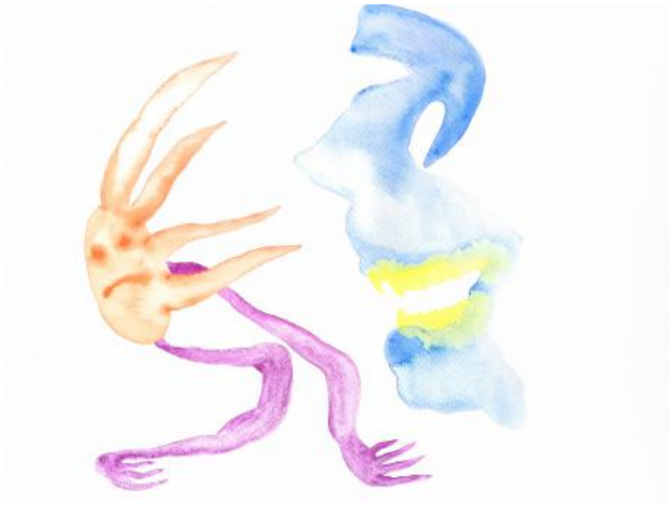
Kannst Du noch?, 2024 Watercolour on paper, 24 x 32cm