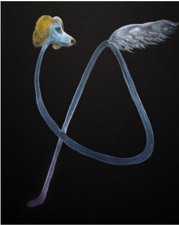
Untitled, 2022 , 2022 Watercolour on black paper, 25,4 x 20,3cm