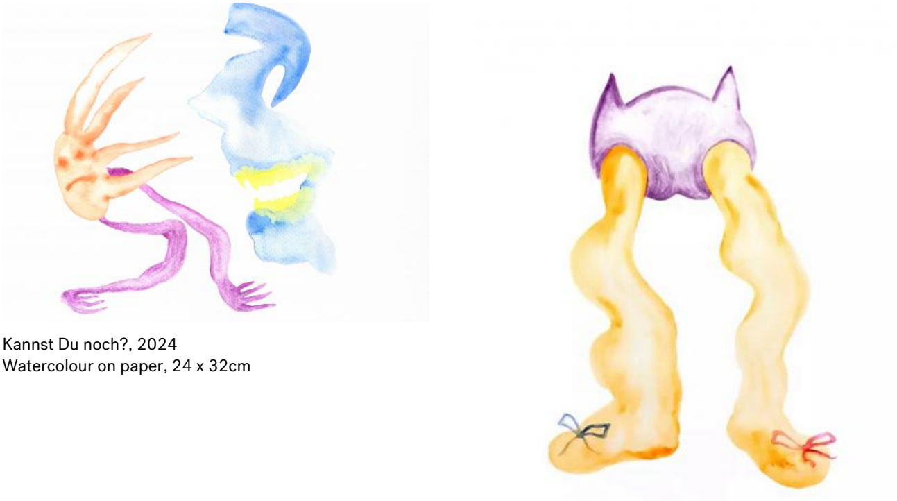
Bothness, 2024 Watercolour on paper, 35 x 27cm