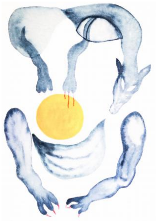
For Better or Worse, 2022 Watercolour and tempera on paper, 24 x 17cm