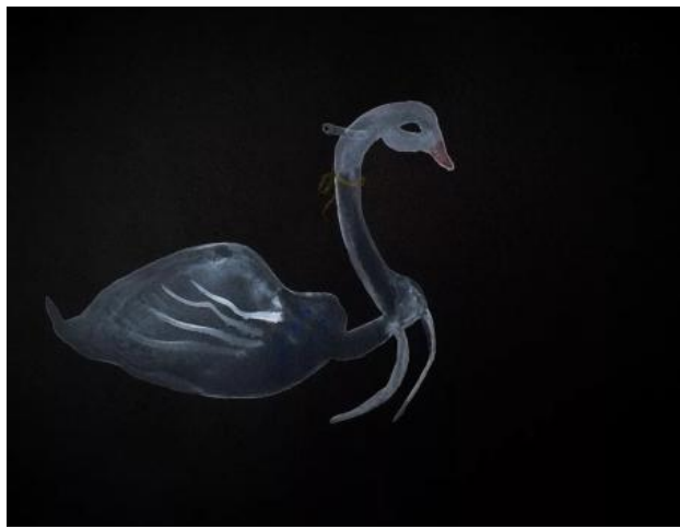
Untitled (The Crossing - series), 2023 Watercolour on black paper , 30,3 x 25,4cm