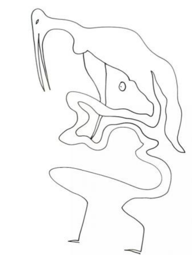
Untitled, 2024 Permanent marker on paper , 42 x 29,7cm