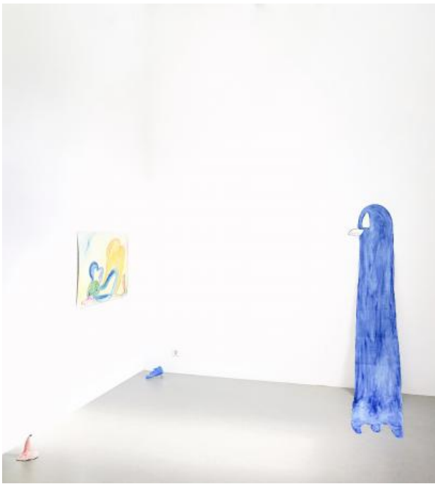
A Sky full of Lucky Birds, 2022