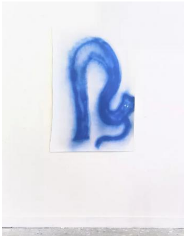
Tulip Blue, 2023 Spraypaint on paper, 149,5 x 98cm