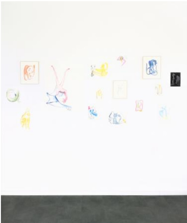
Liquid Marbles, 2022 Watercolour on paper