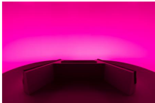
Chasing The Dot, 2024