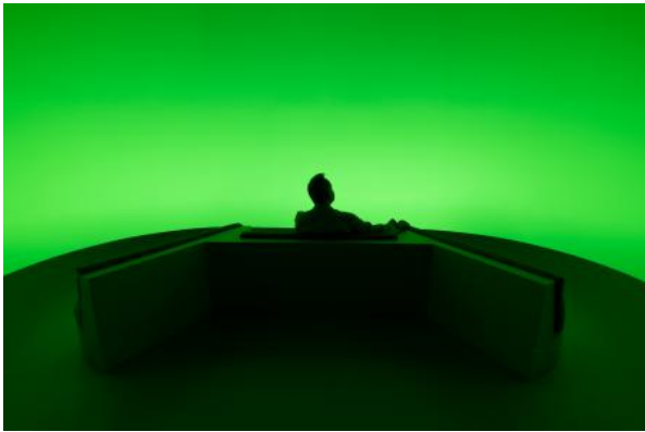
Chasing The Dot, 2024