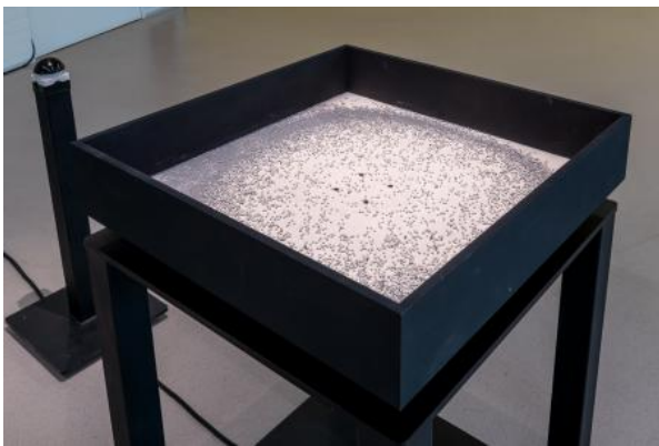
RrrrRrrr, 2025 Steel Glass marbles Low frequency direct drive/tactile transducer Wood, 1 x 1 x 1.50 m