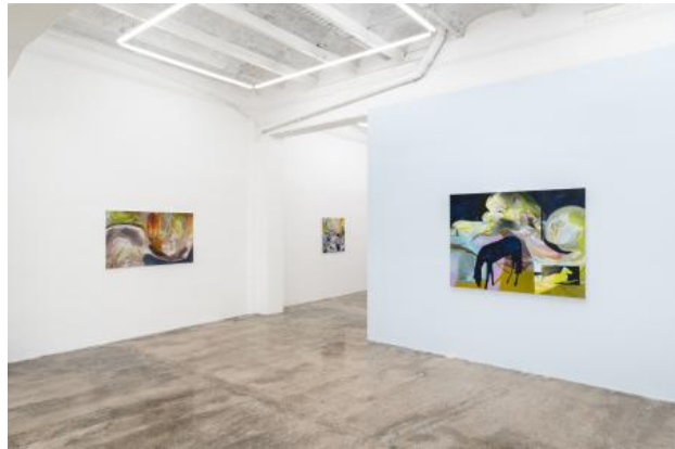
Galaxy Ballroom, 2024