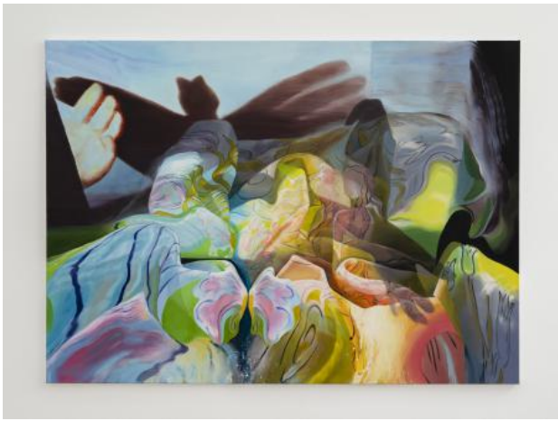
The Shadow of Birds, 2023 oil on linen, 120 x 120 cm