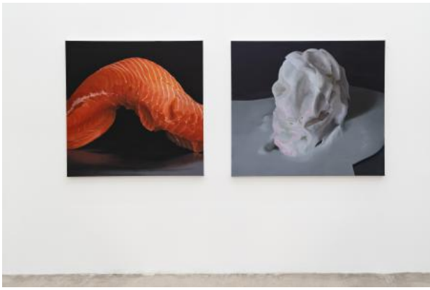
Slits and a Skull, 2021 oil on linen, 120 x 120, 120 x 135 cm