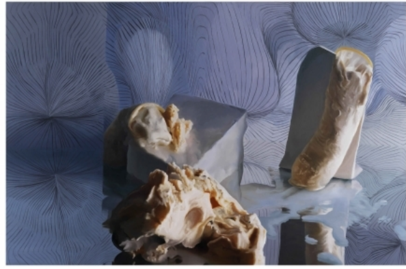
The Days of our Lives, 2015 oil on linen, 145 x 220 cm