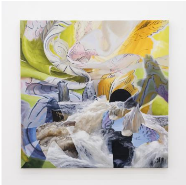
Grief, 2025 oil on linen, 80 x 80 cm