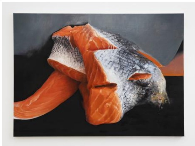
How Deep is your Love? , 2022 oil on linen, 120 x 150 cm