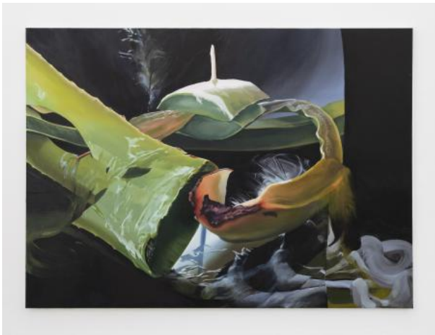
Night, 2023 oil on linen, 120 x 160 cm