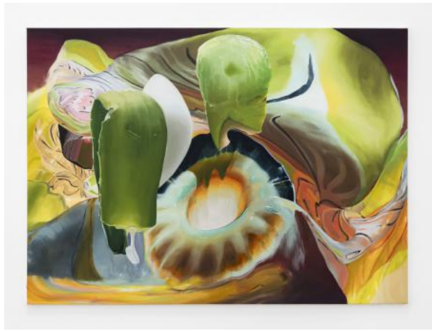
Rift, 2022 oil on linen, 120 x 165 cm