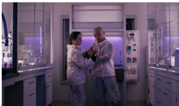
Becoming a Sentinel Species, 2020 Film, 2020, video(18 min), color, stereo