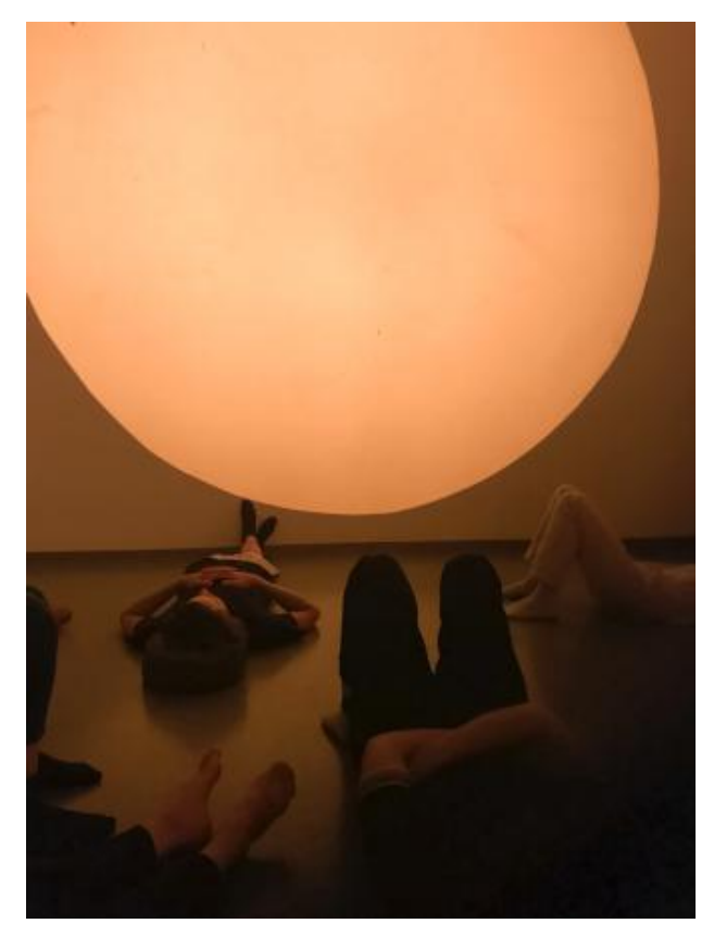
Bathing into Being, 2022 x, x