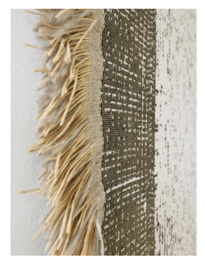
1 cm = 1000 year, 2021 jacquard weaving, 160 x 160 cm