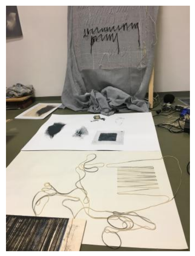
Soil & language, 2022