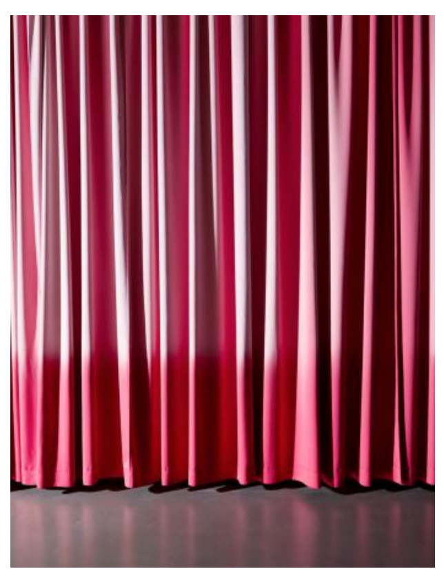
Sún for the Sun, 2022 x, x