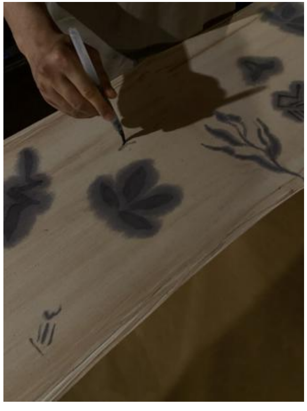
Moonside of a Seed, 2024 Ink & Natural dye, 700 x 40 cm