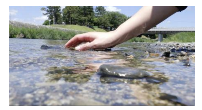
Ukiyo, The Water Way, 2024