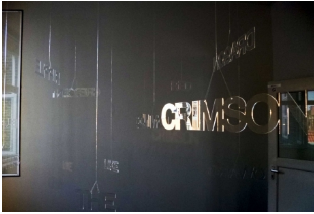
Among the words, 2014 installation, mixed media