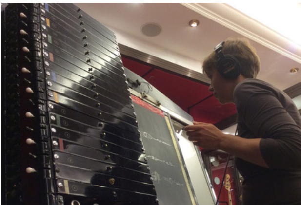
synesthesia 2, 2018 sound-visual installation