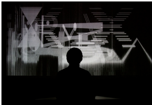
Lettersonic, 2016 live performance, 12 min