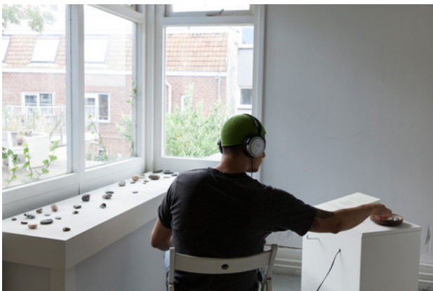
Being a part of..., 2019 audio installation, participatory experience