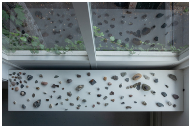
Being a part of..., 2019 audio installation, participatory experience