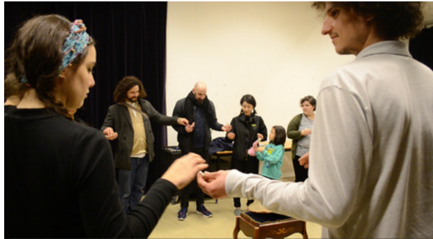
Shared landscape, 2019 participatory performance