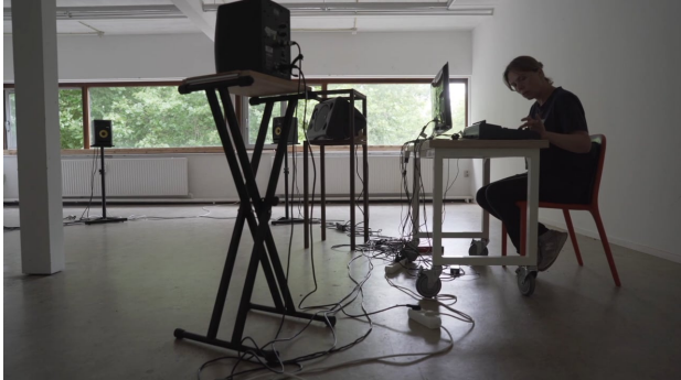
Simple-Intricate, 2020 04:34