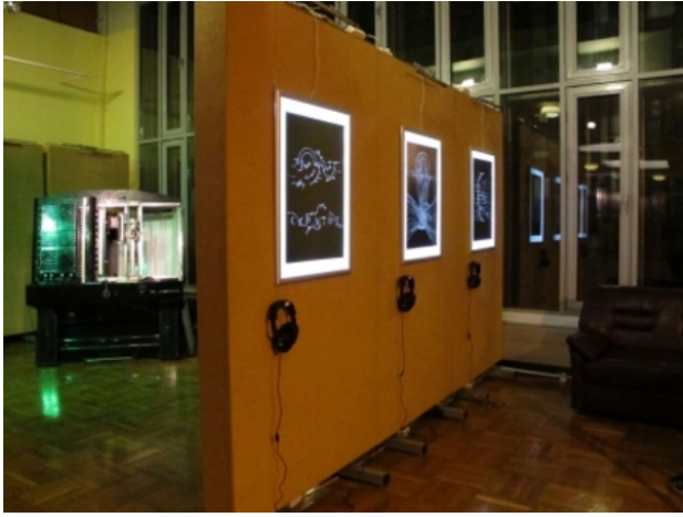
Synesthesia 1, 2014 sound-visual installation