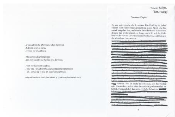
The Gap (Unstable Ground, iteration 03), 2023 Experimental writing, A4