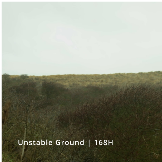
Unstable Ground - 168H, Day 5/7, 2023 01:41