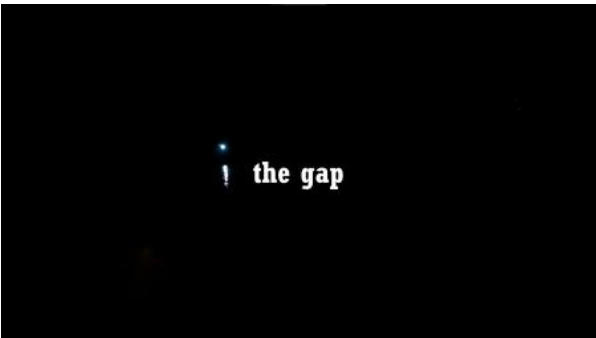
The Gap (Unstable Ground, iteration 03), 2023 video, 20:08 minutes