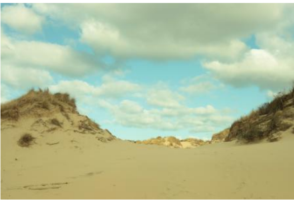
Mirroring Fields (Unstable Ground, iteration 04), 2023 photo