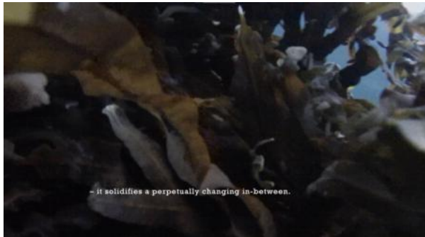
The Gap (Unstable Ground, iteration 03), 2023 video, 20:08 minutes