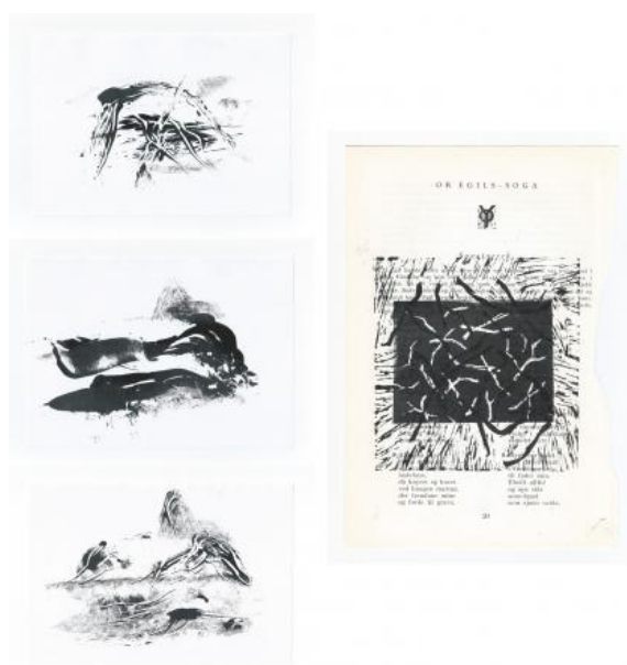
The Gap (Unstable Ground, iteration 03), 2023 monotype printing, A5 each