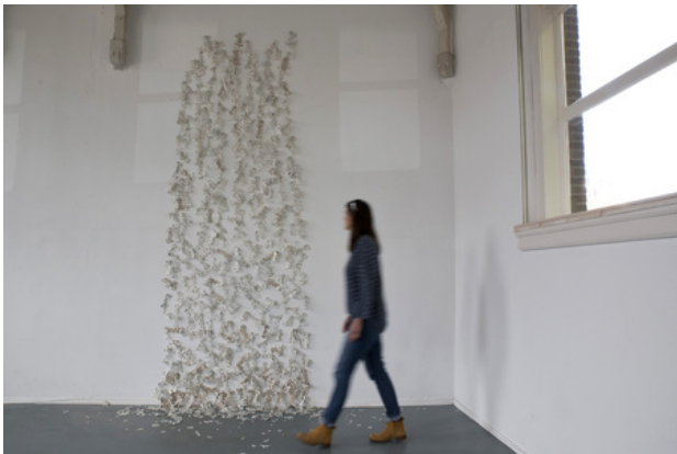
Unite, 2019 handwritten porcelain & steel nails, 180x380cm