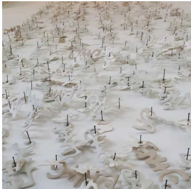
Unite, 2019 hand written porcelain & steel pins, 180x380cm