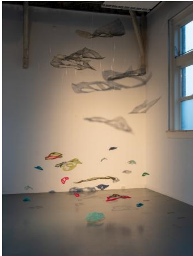
Undercurrent, 2023 Acryl, kippengaas en visdraad, variabel