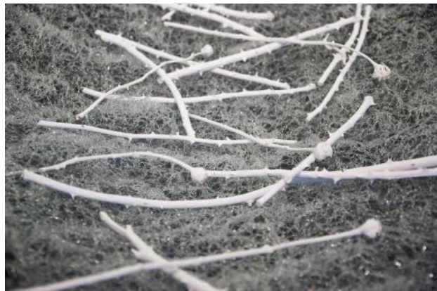
"Life is no bed of roses", 2019 Porcelain, organza, fishing line, rose thorns and bamboo