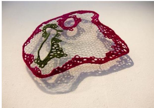
"Back to remember the future", 2020 Acrylic wool and chicken wire, 50x60x10cm