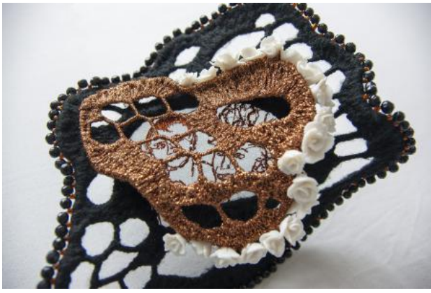
A song of love, 2024 Acryl, kippengaas, porselein en zwarte gitten, 30x30 cm