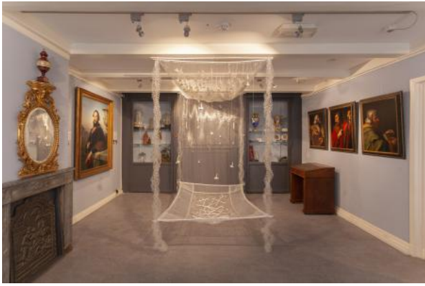
"Life is no bed of roses", 2019 Porcelain, organza, fishing line, rose thorns and bamboo, 200x140x250cm