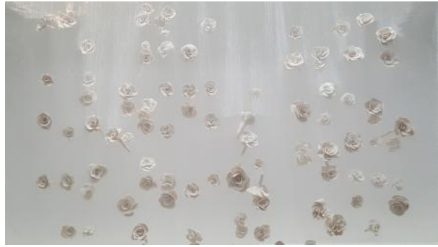
"Life is no bed of roses", 2019 Porcelain, organza, fishing line, rose thorns and bamboo