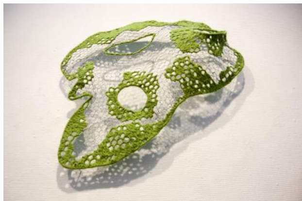
"Back to remember the future", 2020 acrylic wool and chicken wire, 60x60x10