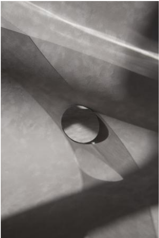
Circle shadow, 2020