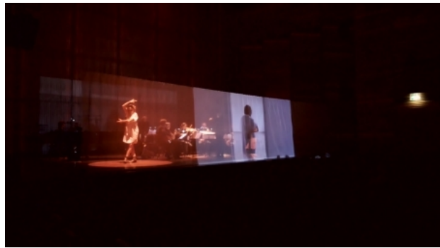
White-Gray-Black, for ensemble, video an, 2017 mixed media, variable