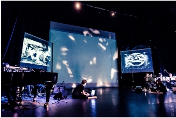
Georges Méliès: The Wizard of Cinema, 2018 mixed media, variable