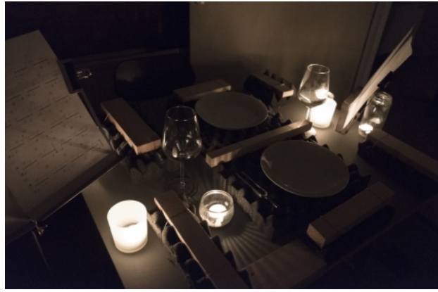
Table 24, 2017 mixed media, variable