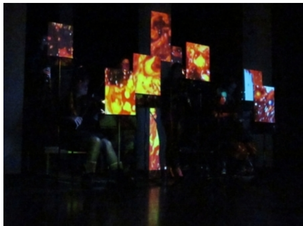
Water-prints, for Catchpenny ensemble an, 2016 mixed media, variable