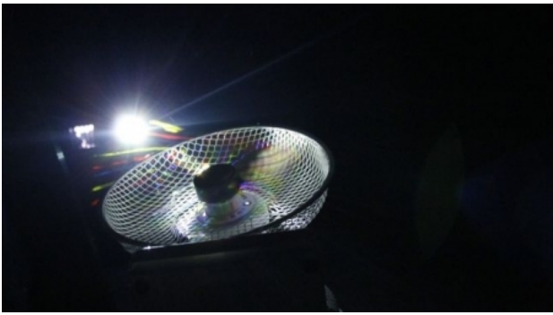
Framework, audio-visual installation, 2015 mixed media, variable