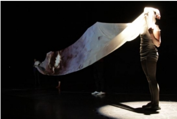
Siren-bal, for singer, tape and projecti, 2015 mixed media, variable