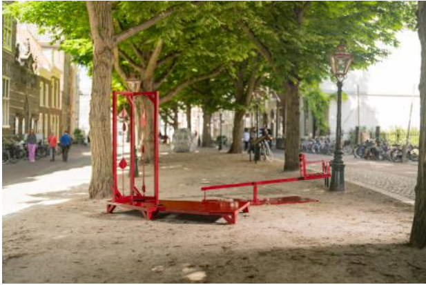
To Take the Chair and Find the Water Cold, 2025

2017 KABK, Thesis Award Nominee Netherlands