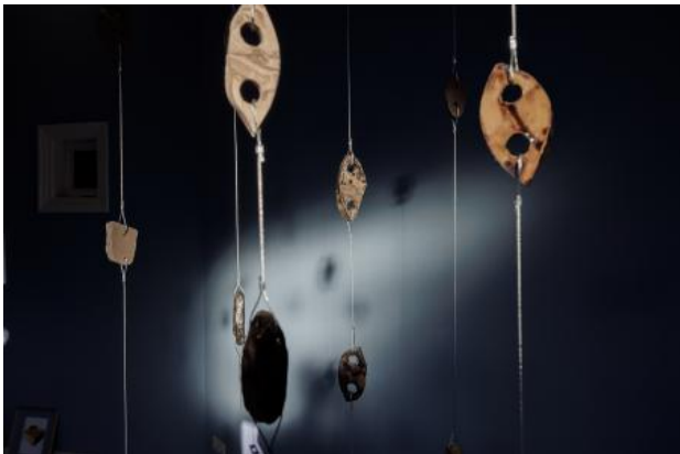
Fault Line, 2025