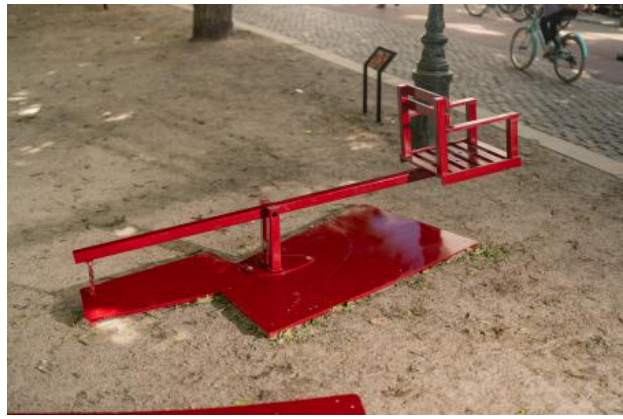
To Take the Chair and Find the Water Cold, 2025