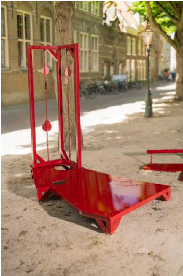
To Take the Chair and Find the Water Cold, 2025