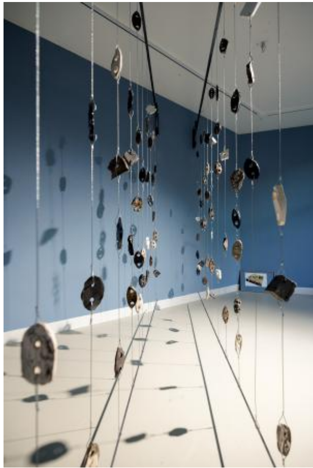
Fault Line, 2025