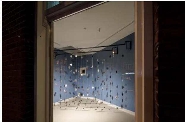
Fault Line, 2025