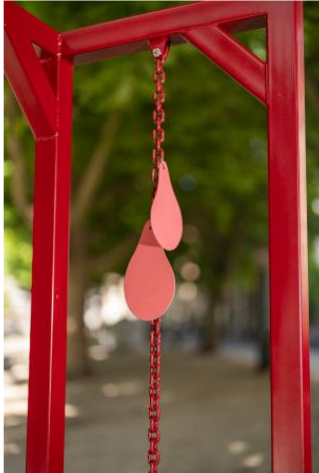
To Take the Chair and Find the Water Cold, 2025