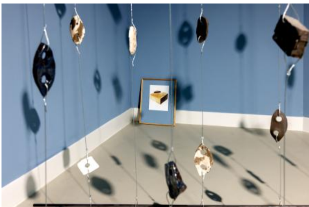
Fault Line, 2025