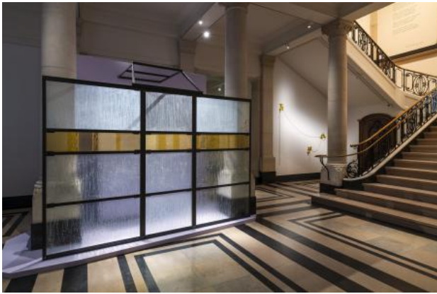
The Wall, 2025