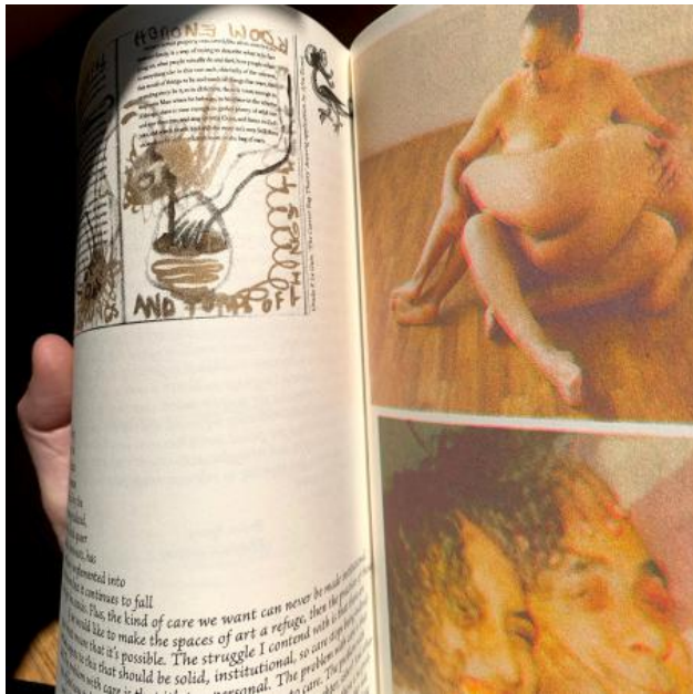
An exploration of wxtch craft as a queer feminist liberators practice , 2021 Essays, drawings, work, lexicon, A5 32 pages