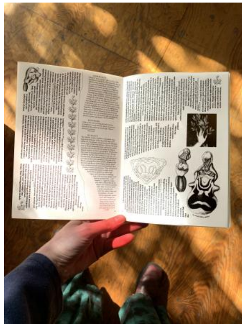
Wxtch Craft zine Edition 3, 2022 Riso, A5