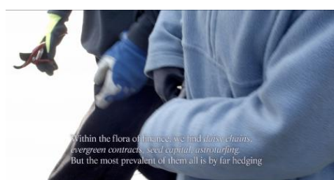
The Flora: Hedging (a.k.a. hedge heist), 2024 Video