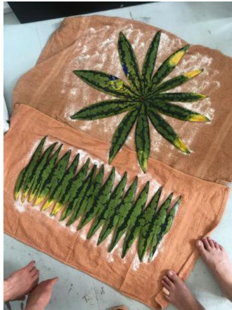
Fertile Imaginaries, A Vessel for 92% Water, 2020 Cutting, preserving, 100cm by 60cm