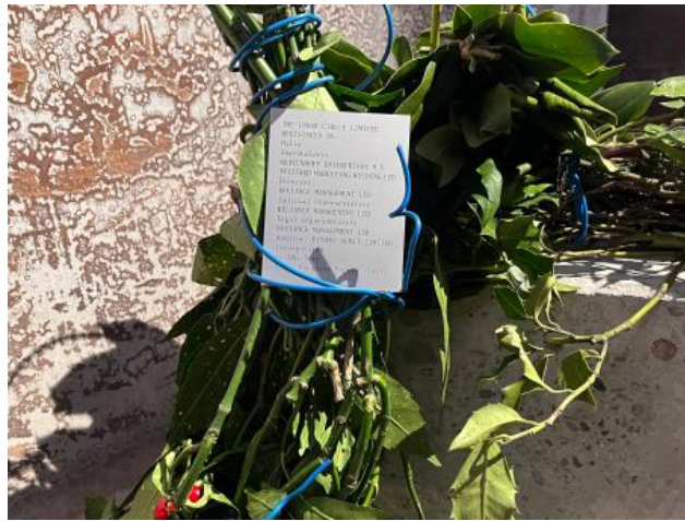
The Flora: hedging, 2024 Clippings, metal engraving