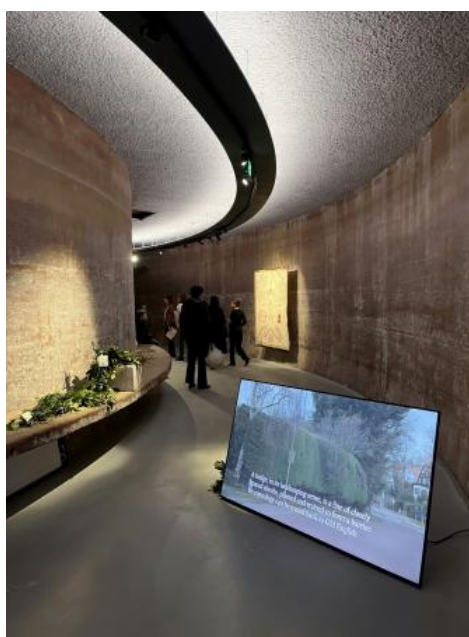
The Flora: Hedging, 2024 Video and prints