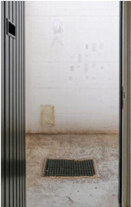
Fertile Imaginaries, 2023 Installation