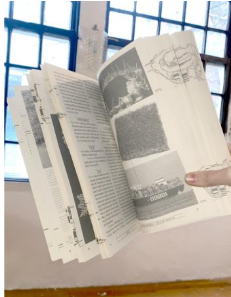
Collapsed Mythologies: A Geofinancial Atlas (Spector Books and Page Not Found, 2025), 2025