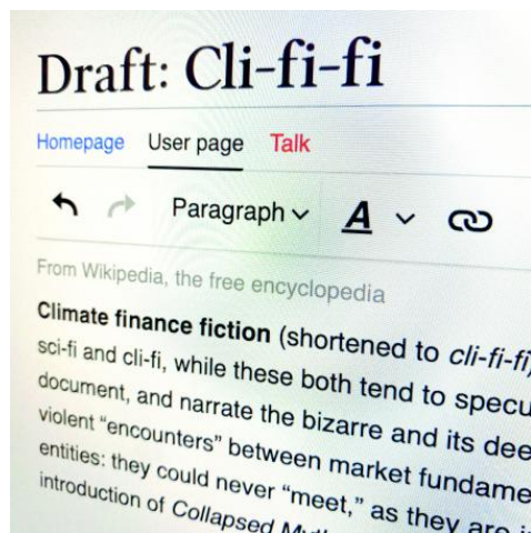
Cli-fi-fi: Climate Finance Fiction, 2025