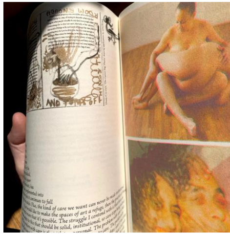
An exploration of wxtch craft as a queer feminist liberators practice , 2021 Essays, drawings, work, lexicon, A5 32 pages