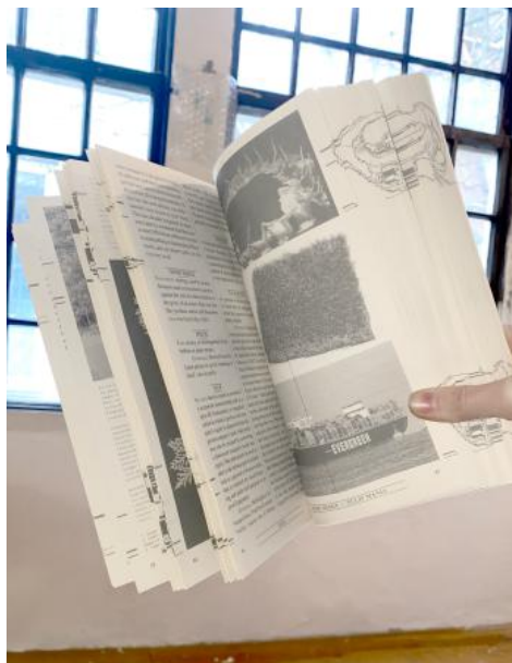
Collapsed Mythologies: A Geofinancial Atlas (Spector Books and Page Not Found, 2025), 2025