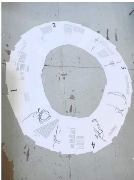
Transitioning to (il)logics, 2019 Text, drawings, performance, 2m x 2m