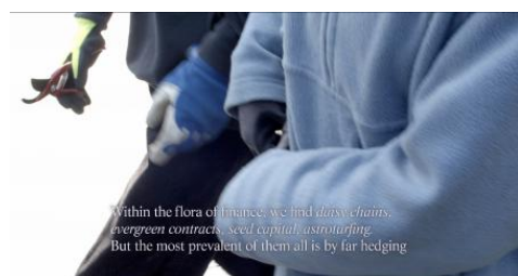
The Flora: Hedging (a.k.a. hedge heist), 2024 Video