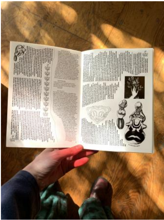
Wxtch Craft zine Edition 3, 2022 Riso, A5