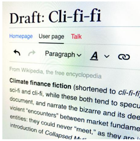
Cli-fi-fi: Climate Finance Fiction, 2025

2013 Toptalent Nomination Gemeente Den Haag The Hague, Netherlands