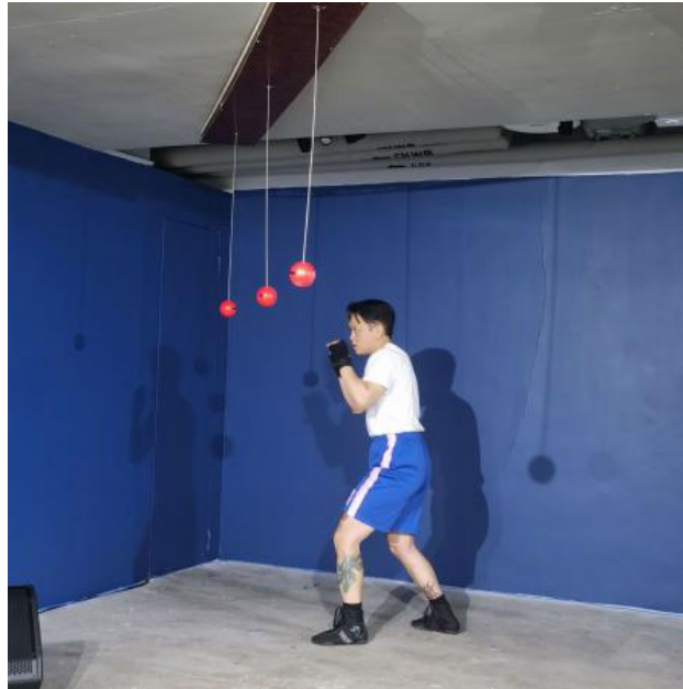
Proximity Drill, 2023 Sound, electronics, performance