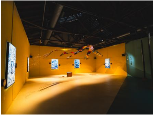
Glitch in The Weave, 2024 woven textiles, conductive thread, digital printed textiles, sound