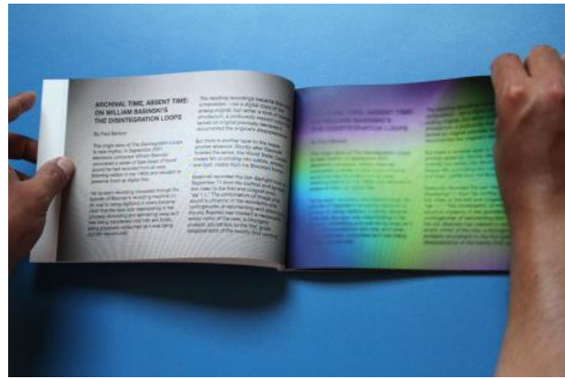
Looking at You Looking at Me, 2021 publicatie, A5