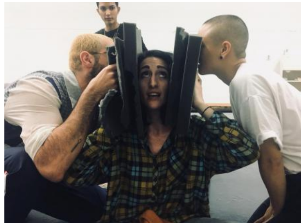
BodyScores, 2018 Workshop