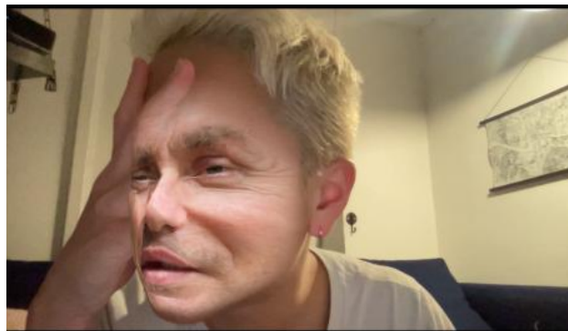
Reframing the Face, 2021 Workshop, 2 hours