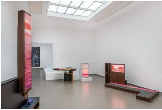
RAUHFASER, Kröller Müller Museum, 2026