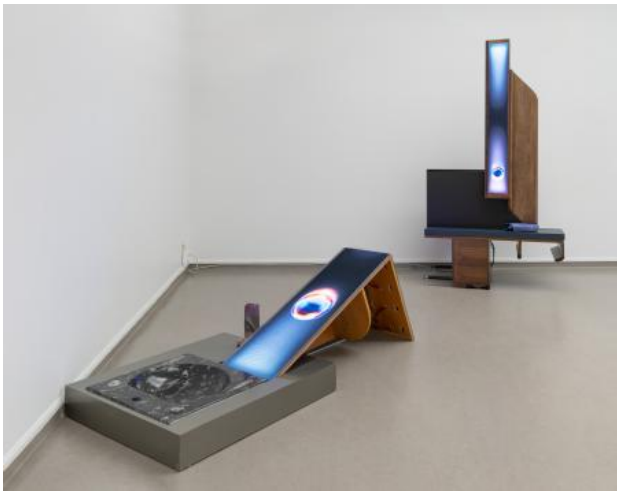
RAUHFASER, Kröller Müller Museum, 2026