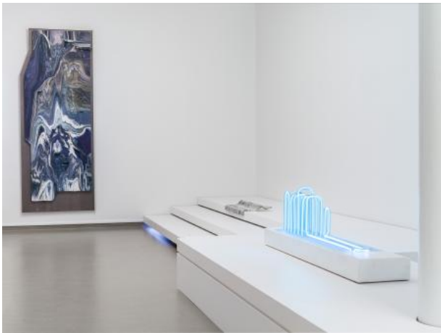
RAUHFASER, Kröller Müller Museum, 2026