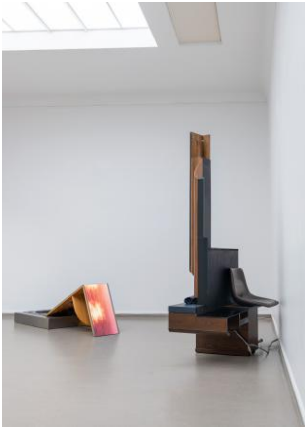
RAUHFASER, Kröller Müller Museum, 2026