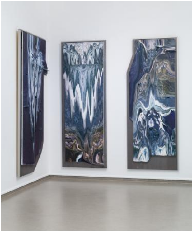
RAUHFASER, Kröller Müller Museum, 2026