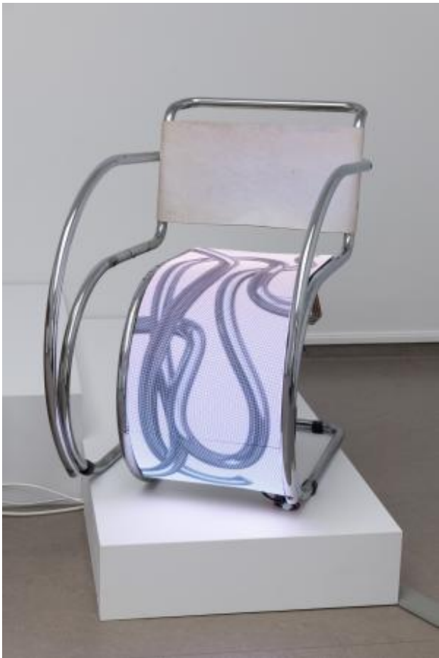
RAUHFASER, Kröller Müller Museum, 2026