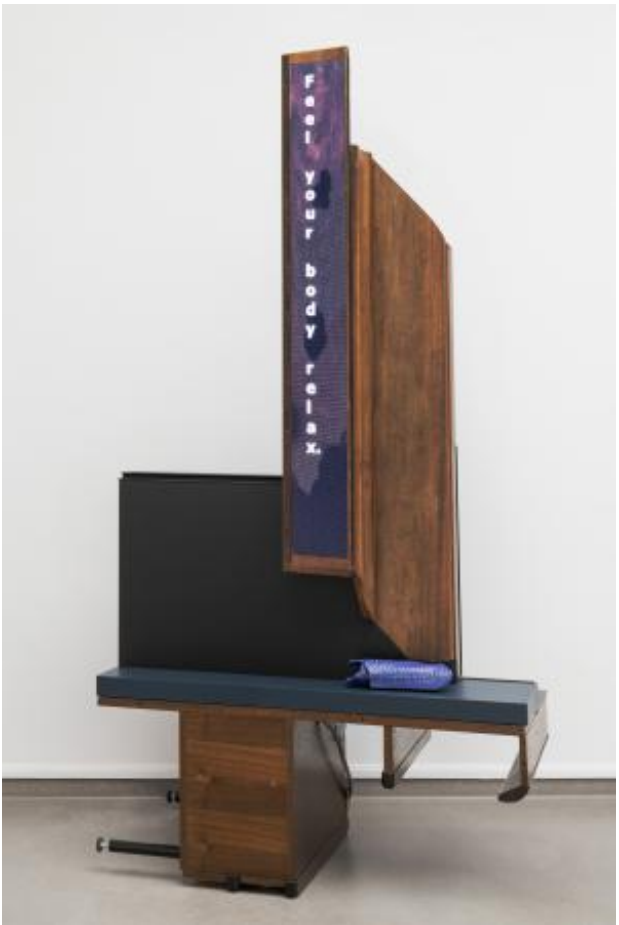
RAUHFASER, Kröller Müller Museum, 2026