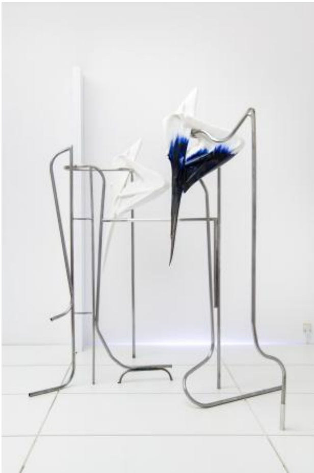
RAUHFASER, Kröller Müller Museum, 2026