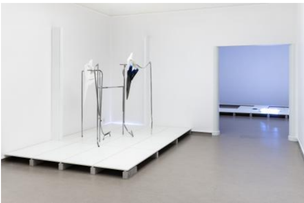
RAUHFASER, Kröller Müller Museum, 2026