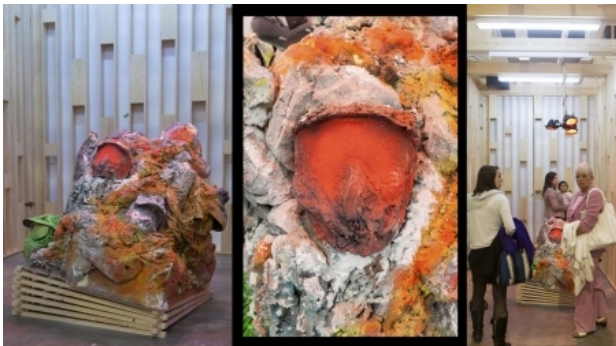
Shrine Arena, 2015 paintball maskers, verf, cement, beton,