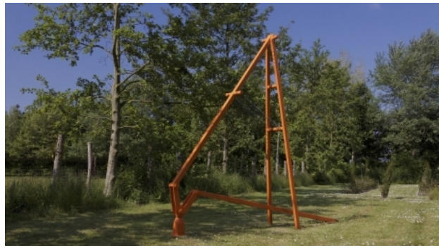
Object, 2013 hout, lak, 400 cm hoog