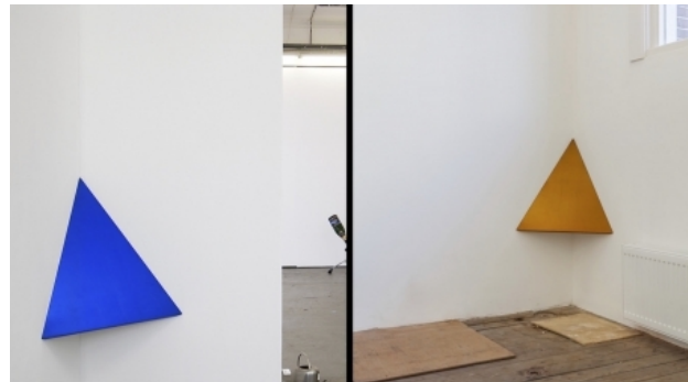
Prohibited blue, Prohibited Copper, 2015 spandex op hout