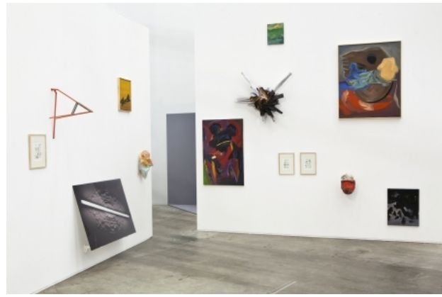
..., 2016 olieverf op doek, pur, verf, verkoold sc