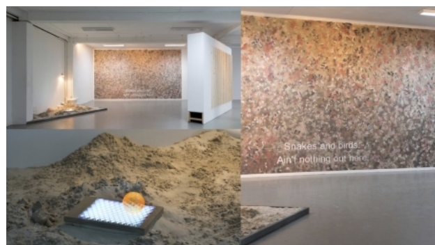
Detourist, 2014 cement, metallic verf, zand, gezichtsbru