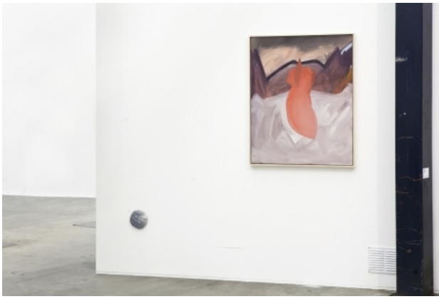
Moon ; Glacier ; Vent, 2016 gips wandsculptuur ; olieverf op doek ;