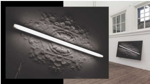
Ornament, 2015 foto op plexiglas, 100cm * 70cm