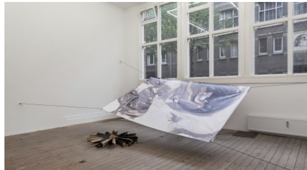
Prop V2 + Shroud + contraband, 2015 print op pvc (shroud) ; verkoold sculptuur