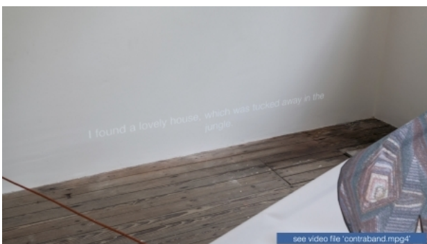
Contraband, 2015 HD video, 07:45min continuous loop