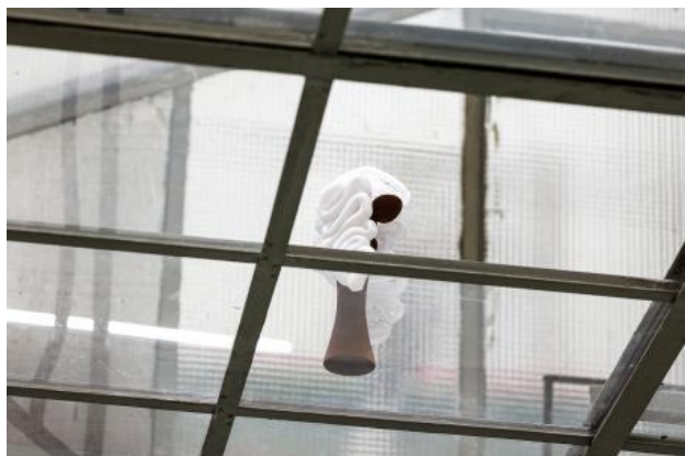
The Old Judge, 2022 glass, iron, oxidative agent