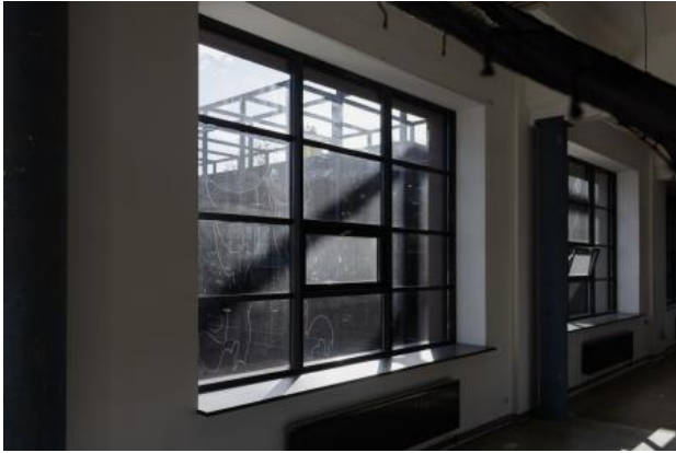
Bush Legs, 2025

2009 - -- Curator Version Festival, Chicago