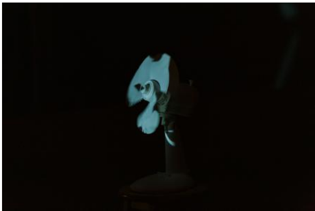
Centrifuge, 2023 digital animation on a found ventilator