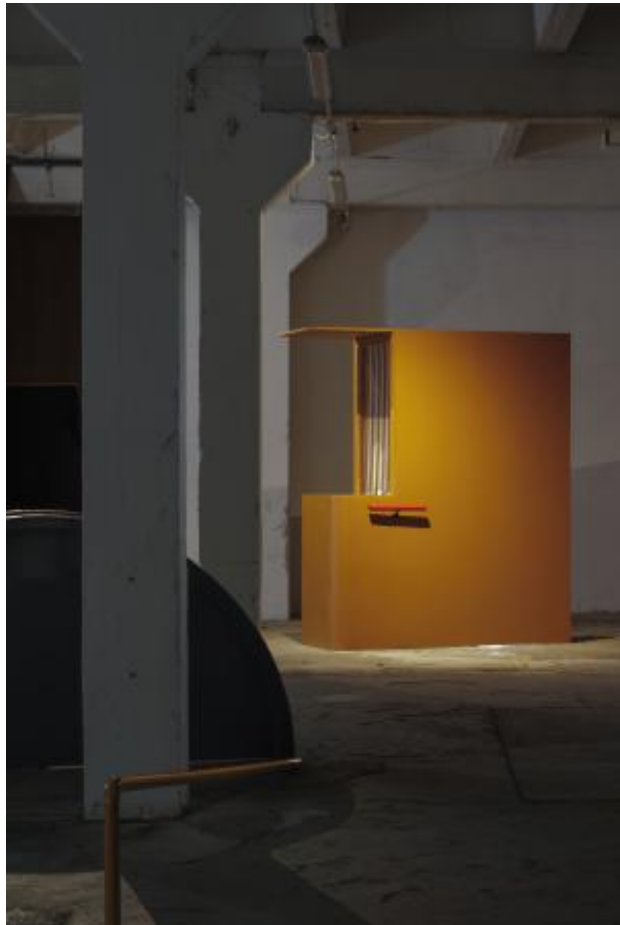
Kiosk, 2023 mixed media