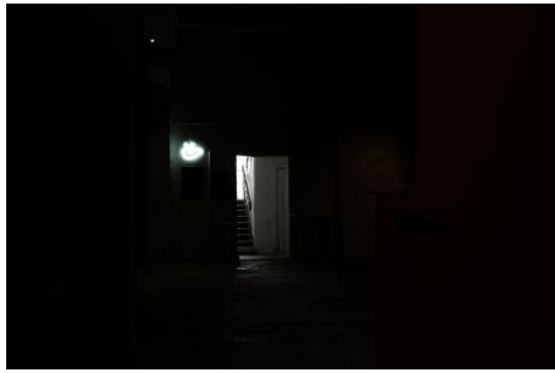
"Rosme", 2023 found objects, neon , glass