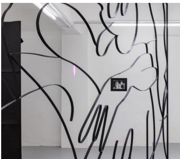
"The Prompt", 2022