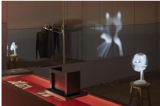
Centrifuge, 2023 mixed media, digital animation on a found ventilator