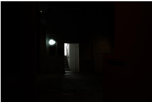
"Rosme", 2023 found objects, neon , glass