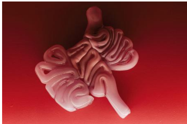
Glass Grief, 2023 glass