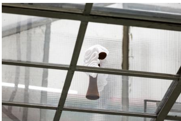
The Old Judge, 2022 glass, iron, oxidative agent