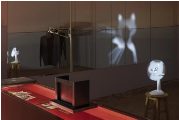
Centrifuge, 2023 mixed media, digital animation on a found ventilator