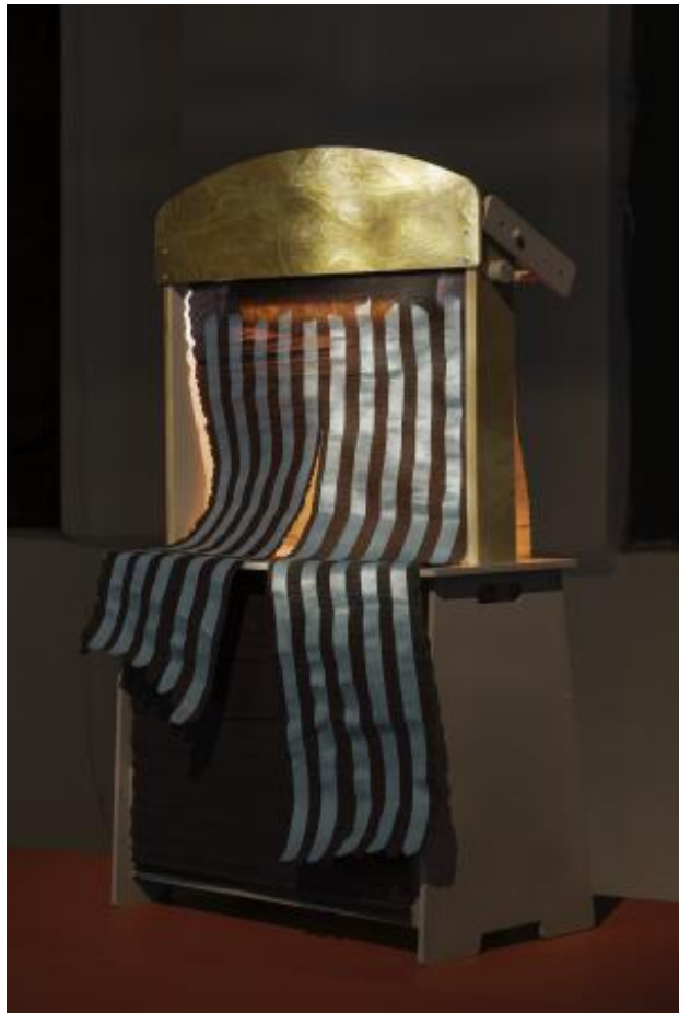
Method of Loci, 2023 mixed media