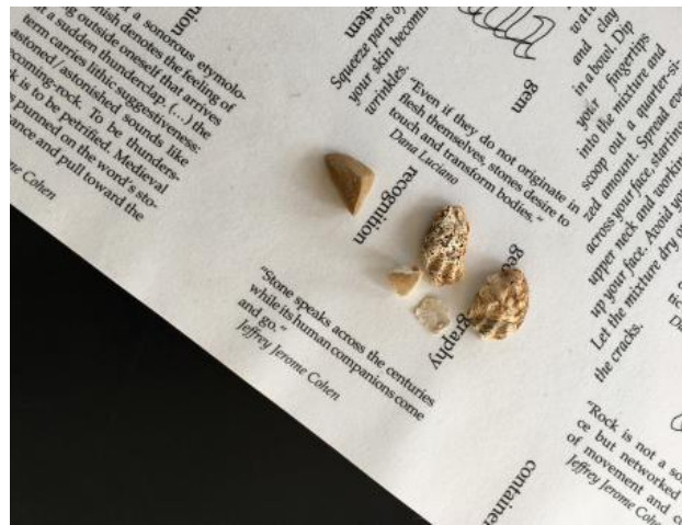
Stone Network, 2022 embodiment gathering, variable