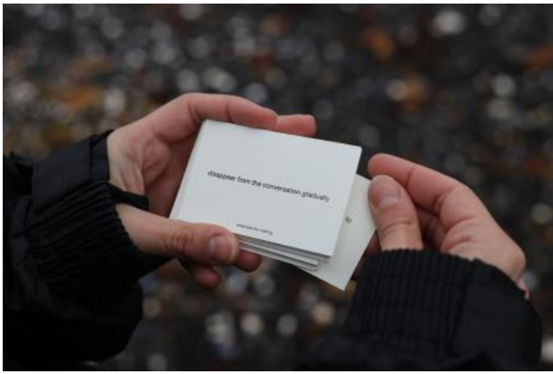
thoughts on thaw, 2025 set of printed paper cards, 82 x 52mm