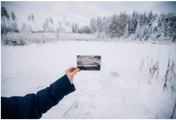
"wa(l)king the meteorite", 2023 video documentation with live voiceover, 8min reading and video