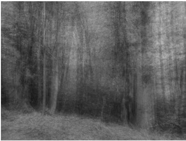
time is an animal, 2024 digital image, work-in-progress