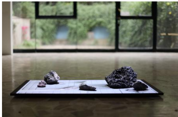
mineral everybody II, 2023 video installation, 70 x 120 x 40 cm; 22min