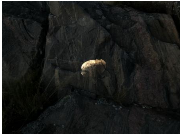
Örö meteorite, 2025 video projection on a stone outdoors, variable