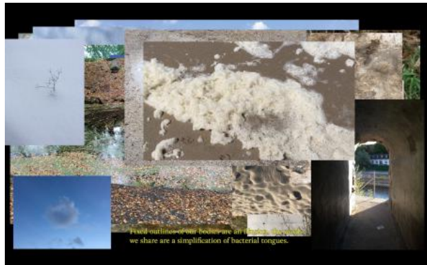
every second is kissed by billions of lips (love letter to 'dierkens'), 2023 video; 7,5min, projected on 200x112,5cm screen