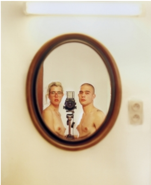
Marble Moon, 2014 Photography