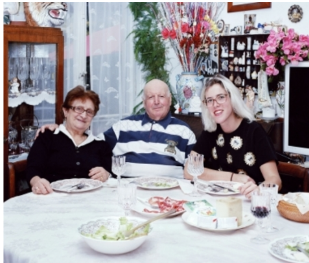
L'invitation, 2013 Photography, performance