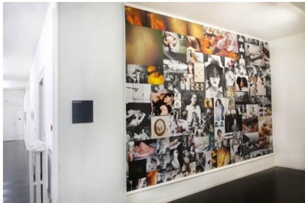
Womb, 2014 Photography, installation, 280X420