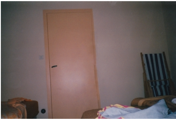
Where I belong, 2013 Montage