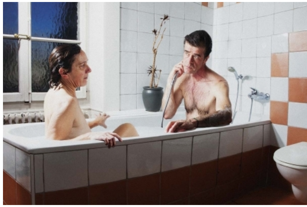
Second Round, 2014 Photography, collage, montage