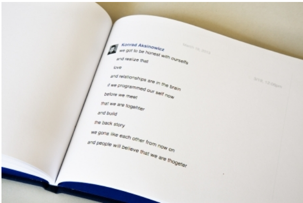
Pedro, 2013 Photography, performance, publication, 19.5X15.5