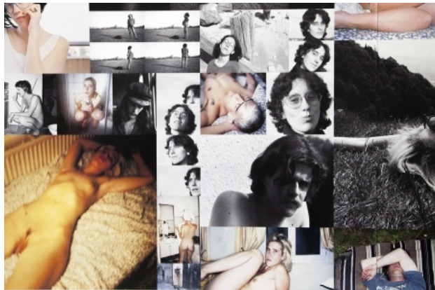
Womb, 2014 Photography, installation, 280X420