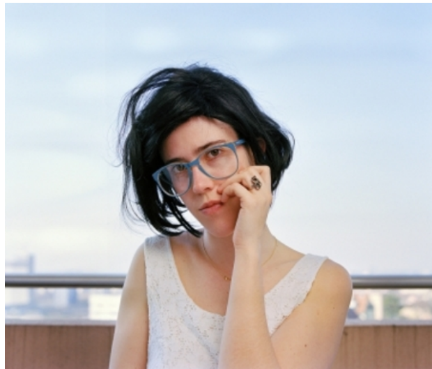
The Third One, 2014 Photography