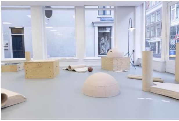
Pointing At Things Is The New Writing , 2025 Ceramics