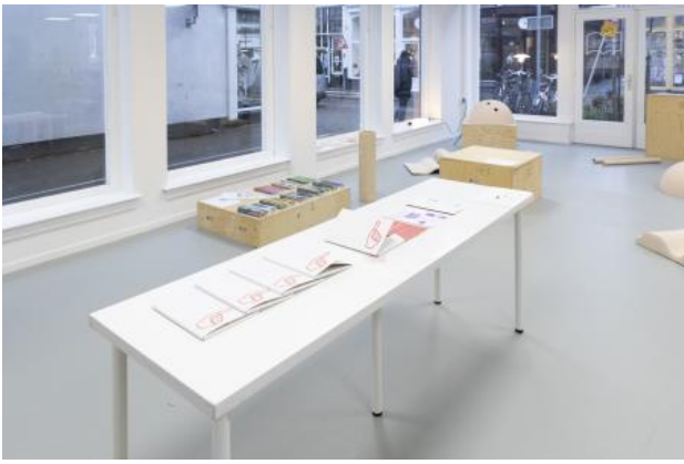
Pointing At Things Is The New Writing , 2025