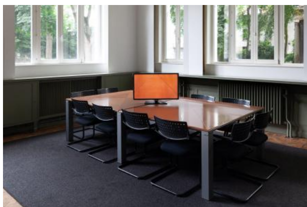
I found a shortcut through your hedge, 2021