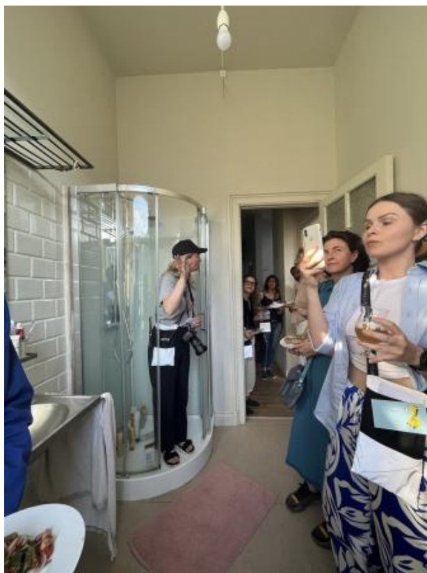
The Residency Tour, 2022 Performance, Stained Glass Window