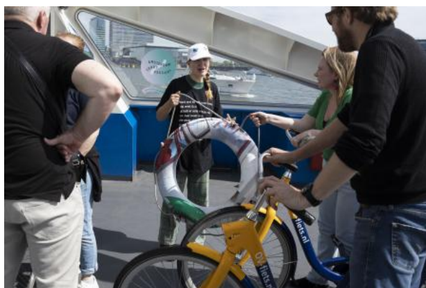
Verdwaal van hier naar daar vandaan dwaal af, 2022