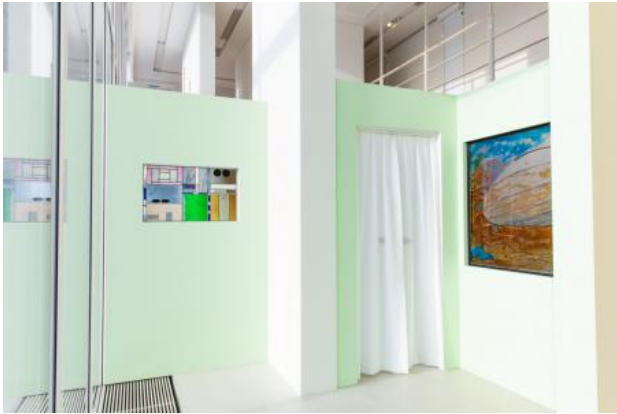
The Residency Plan, 2024 Stained Glass