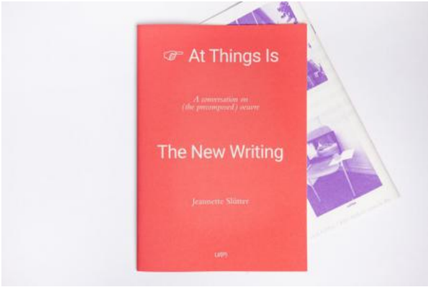
Pointing at things is the new writing, 2023 Publication