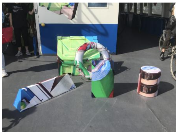
Verdwaal van hier naar daar vandaan dwaal af, 2022 Objects, Photoprint