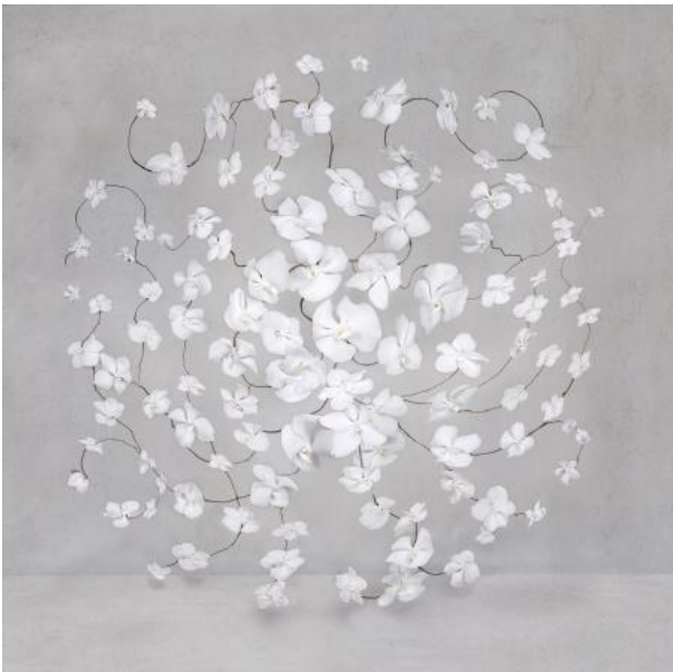
Infinite White, 2024 Photography, 150 x 150