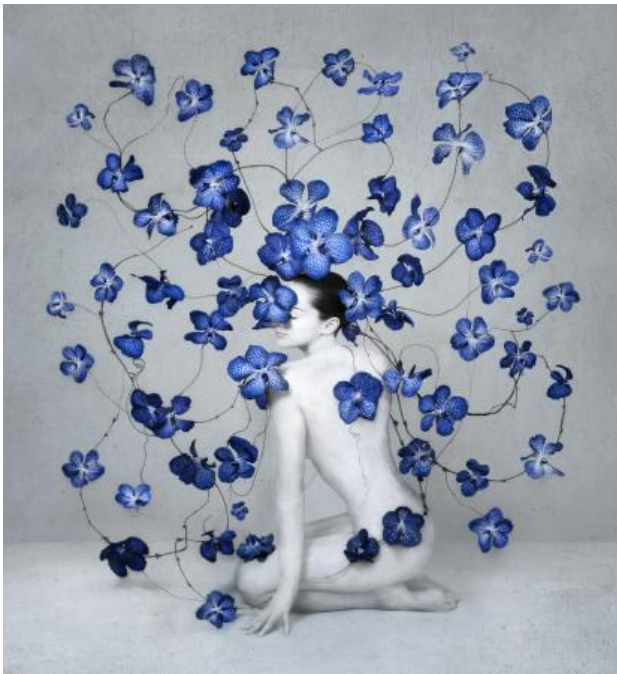
Bliss, 2024 Photography, 151 x 141