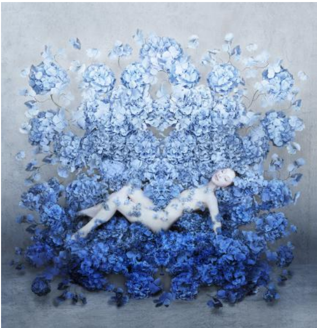
Blue Horizons, 2024 Fotografie, 150 x 150 cm