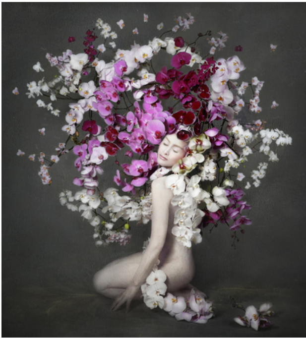
Resource, 2020 photography, 155 x 155