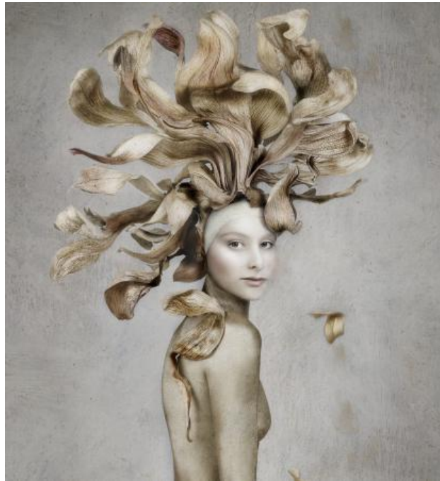
Soil, 2021 fotografie, 113 x 103 cm