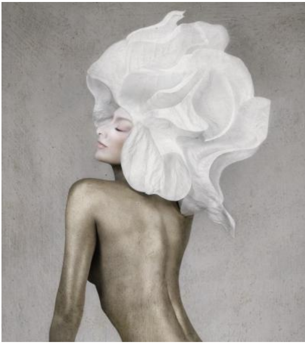
Triumph, 2022 fotografie , 110 x 103 cm