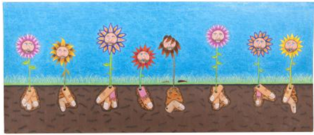
The garden, 2025