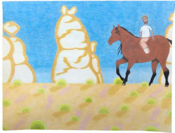
Seeking interconnection, finding it, missing it, 2025