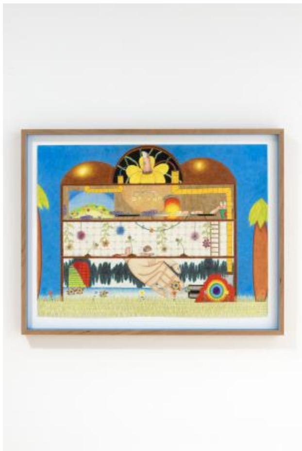
The house, 2024 pencil and paper, 29,6 x 40 cm