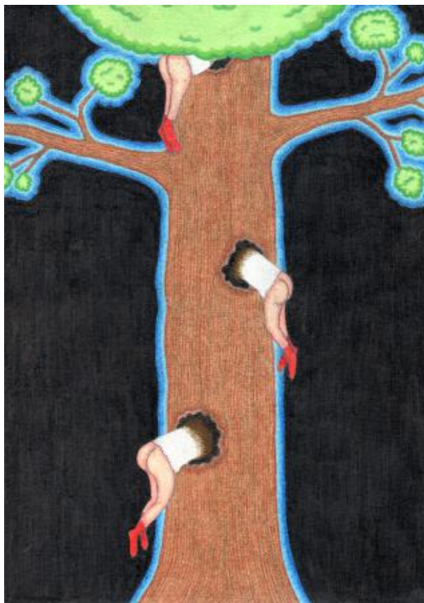
Midnight hideout, 2024 pencil and paper, 14,8 x 21 cm