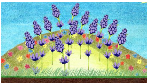
Towards tranquility, sanguinity, 2024 video (10:59), -