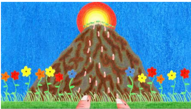
Beyond the mountain, into the forest... please?, 2024 video (16:19 min.), n.v.t.