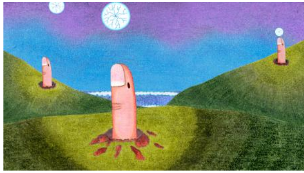
charge cycle, 2026 video (20:21 min.), -