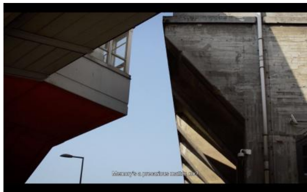
Testament, 2019 Video