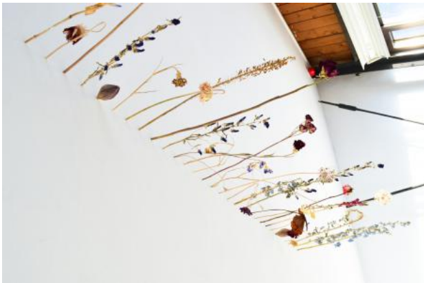
accusers/confessions (Trying to to resist the urge to fall) , 2021 Mixed media