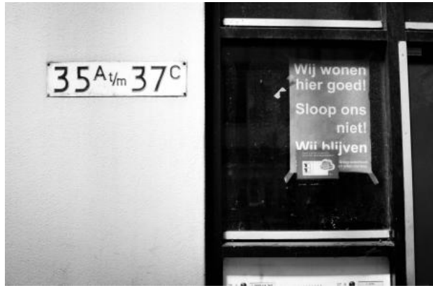
Annotations on Afrikaanderwijk, 2019 Printed matter