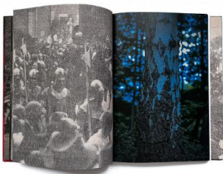
page from photobook Drakeblood , 2023 offset print, 170 x 240 x 10 mm