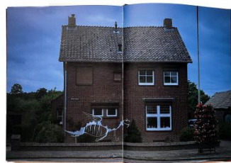
Drakeblood / blood of the dragon - photobook, 2023 Offset printing - 188 pages of interior content + 2x 4 pages of glued endpapers in HARDCOVER., 170 x 240 mm