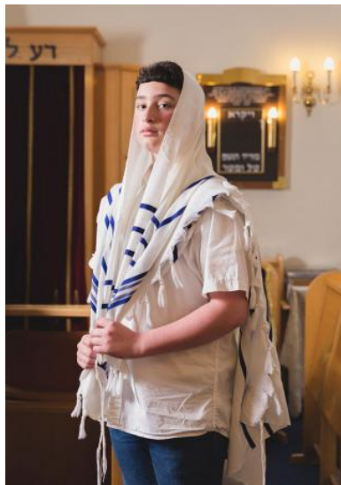
Portrait of Ran for the exhibition 300 years of Pinkas, 2023