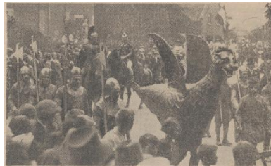
draak lam tam, 1935, 2023 reproduction, 21 x 16 cm