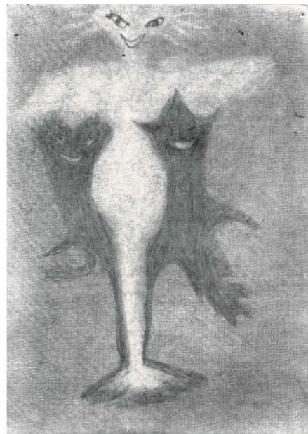
Friends, 2021 Graphite on paper , 15x11