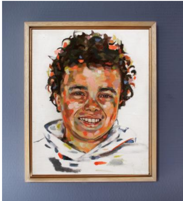
Felix, 2020 oil on canvas, 30cm x 24cm