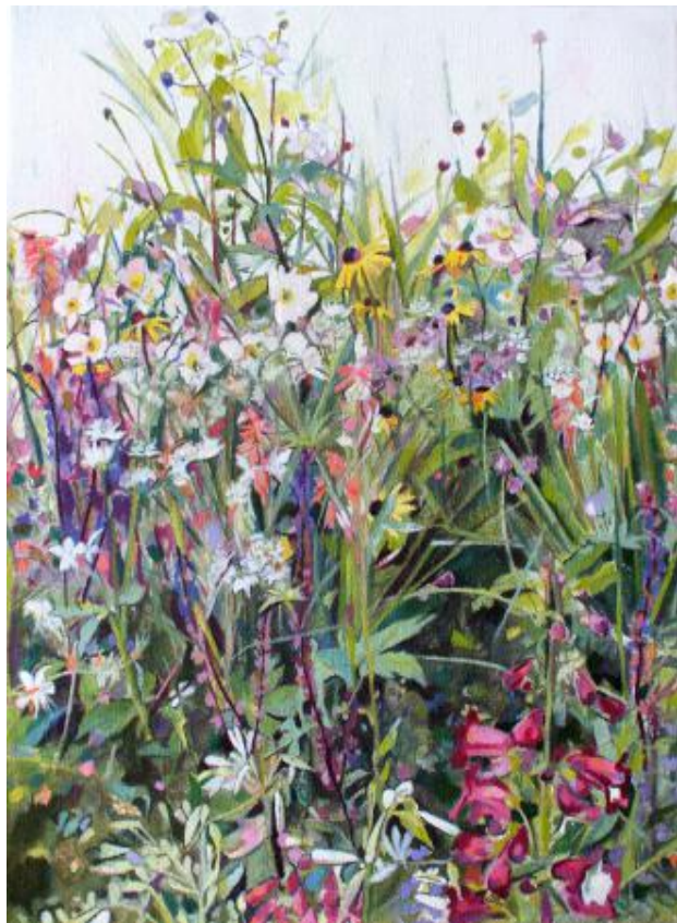
Leona, 2021 oil on canvas, 30cm x 40 cm