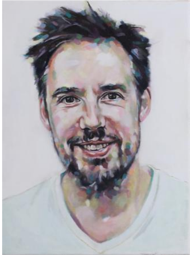
Rogier, 2023 oil on canvas, 30 x 40 cm