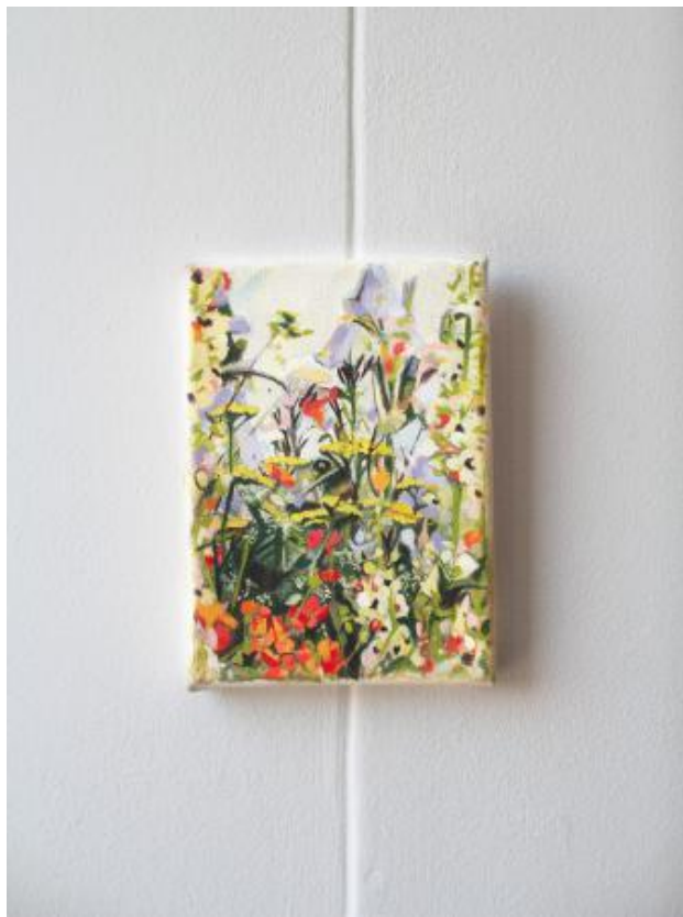
Elsie, 2021 oil on canvas, 13cm x 18cm