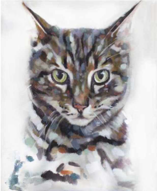
Chulo, 2023 oil on canvas, 24 x 30 cm