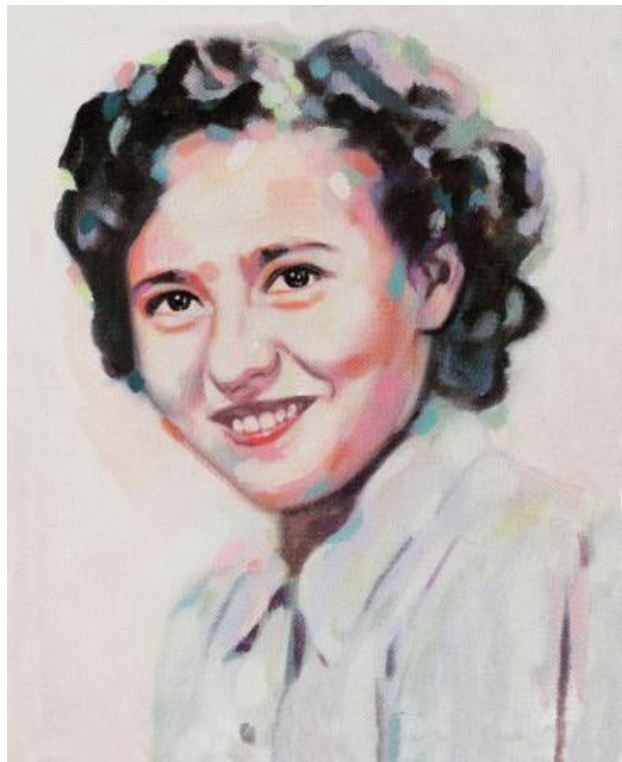
, 2022 oil on canvas, 24 x 30 cm