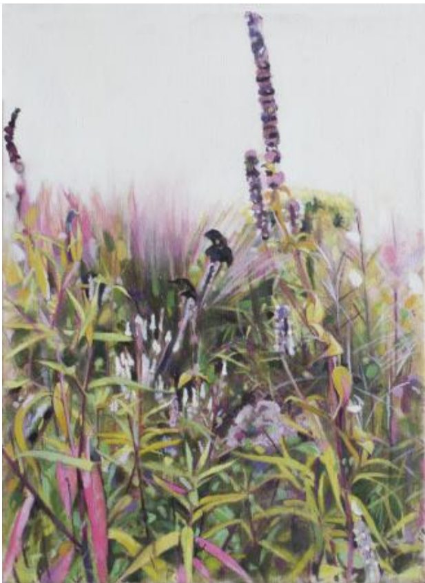
Darline, 2022 oil on canvas, 30 x 40 cm