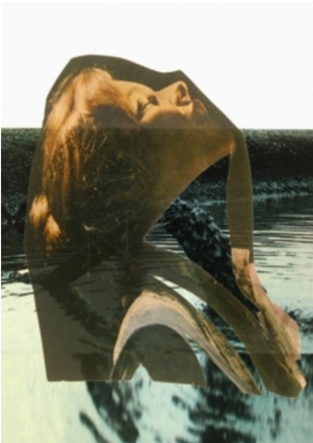
Fill her, 2015 Collage