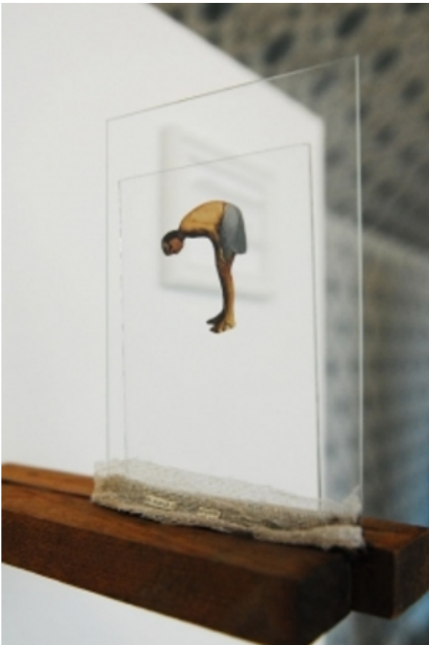
In search of neutral ground, 2017 Mixed media collage