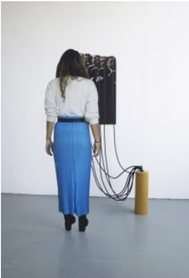
What is the core's source?, 2014 Sculptuur installatie