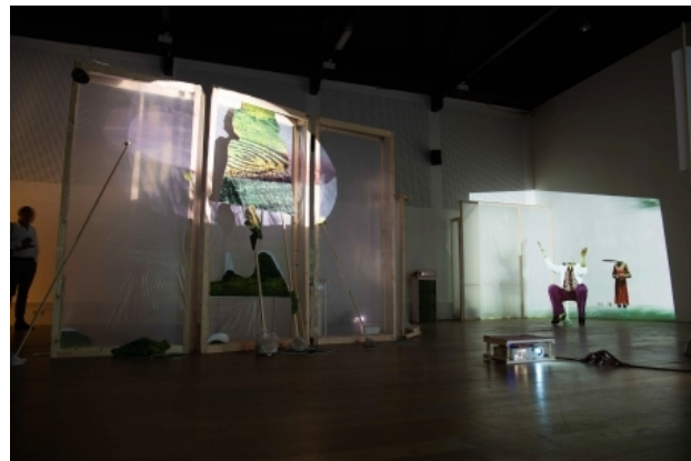
A state of affairs IV , 2018 Mixed-media Installatie