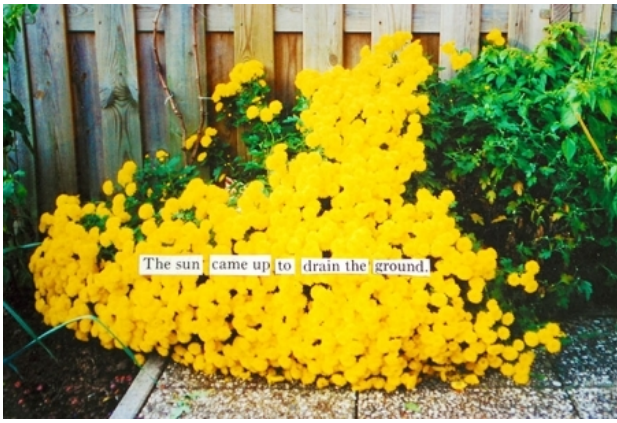
Yellow, 2017 collage