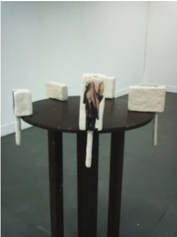
Unavailable, 2013 Sculptuur