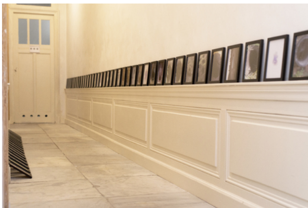
Holes, 2020 Photographs