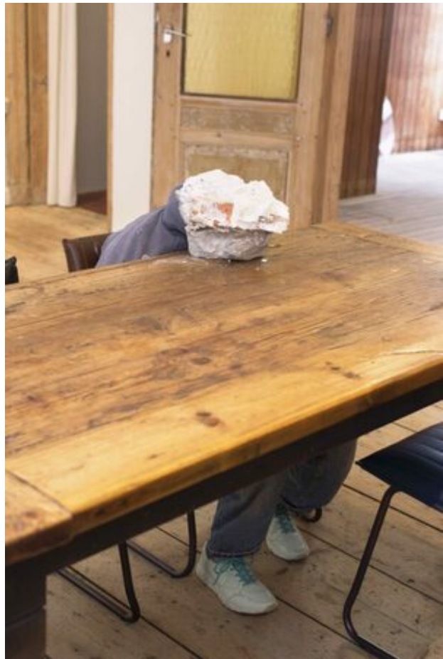
Steenhoofd (Stonehead), 2020 Bricks, plaster, shoes, wood, fabric