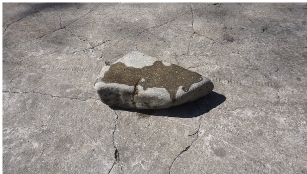
34 seconds of a 657 second video, 2020

2010 Re-Unification KABK , Den Haag The Hague, Netherlands First prize in competition. A collaboration between the Embassy of the Federal Republic of Germany and the KABK, The Hague