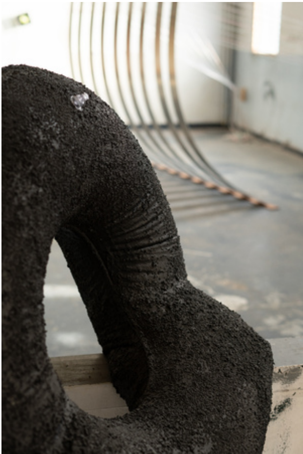
No way (3) (detail), 2020