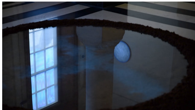
Hermine van Bers Beeldende Kunstprijs, 2020