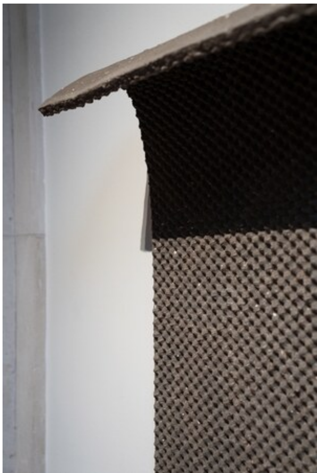
Sediment (detail), 2020 Sand, glue, polyether, 180 x 100