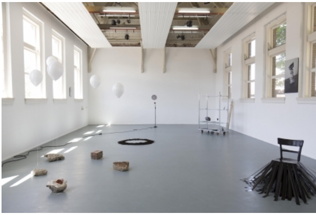
What is actually happening, 2017