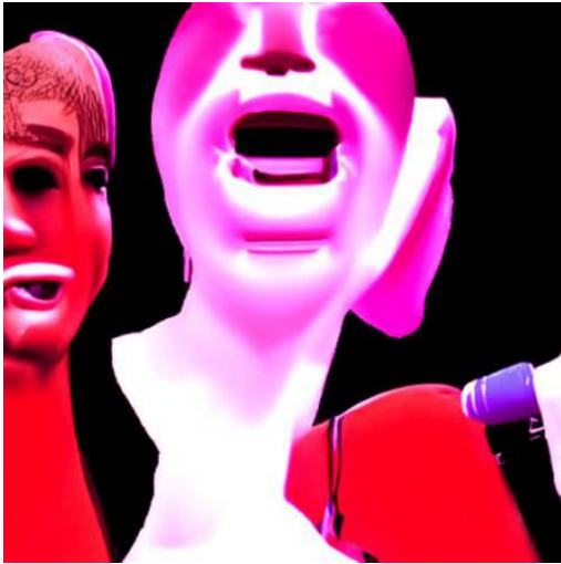
In Search of Good Ancestors, 2022 generative radio broadcast, AI, workshops