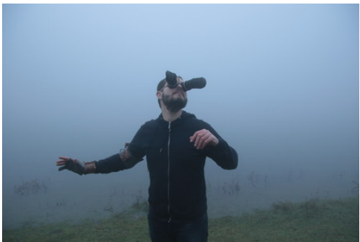
Sensory Cartographies Institute, 2016 worn instruments, speculative research