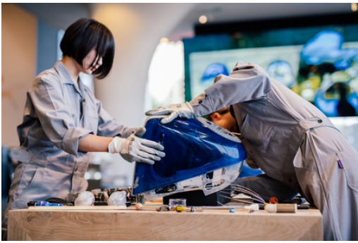
if this then that, 2018 performance art, music composition, video