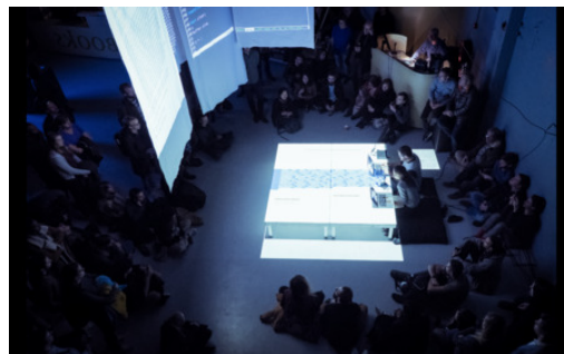
Anatomies of Intelligence, 2019 web-based, performance, algorithms, catalog of research