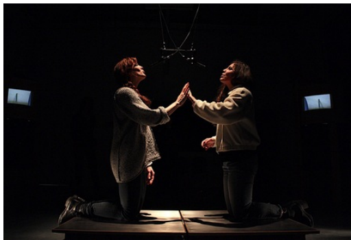
Satellite Skin, 2017 sculpture-performance, installation, app