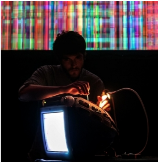
iMac Music, 2017 performance, audiovisual, outsider art