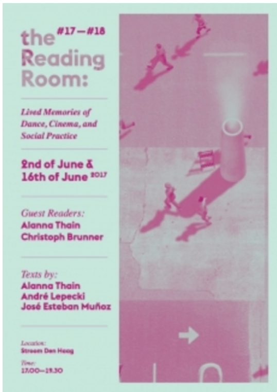
The Reading Room (series), 2018 curatorial-community, collective study