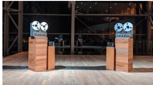
Wordless, 2020 robotically controlled tape machines, machine-learning corpus-based speech synthesis system