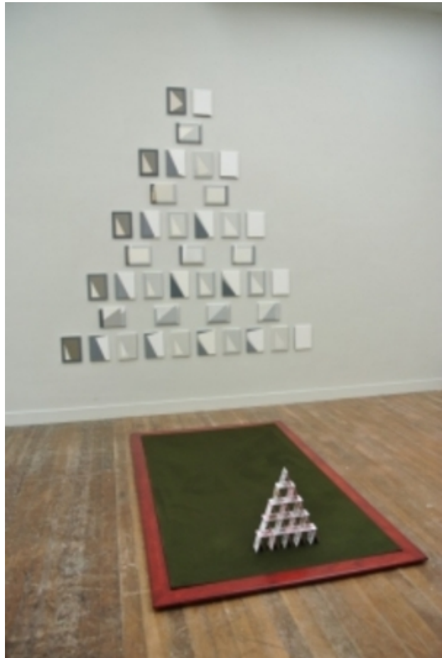
zeepbakjes, 2015 keramiek, 150 bij een diameter van 50 cm