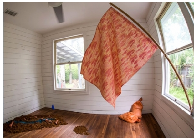
Stars and Stripes, 2016 Batik, keramiek