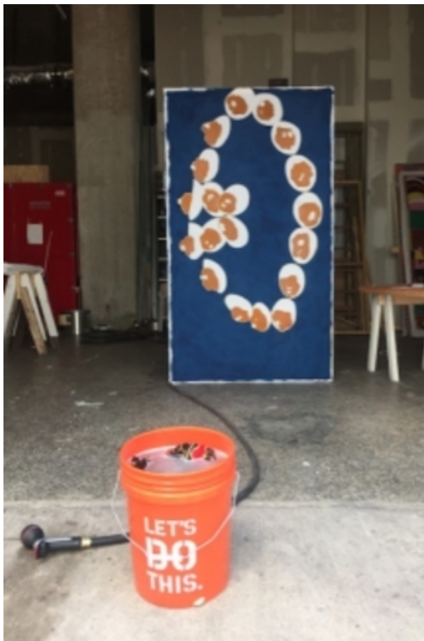
Bij wijze van Ham, 2017 Batik, 300 bij 135