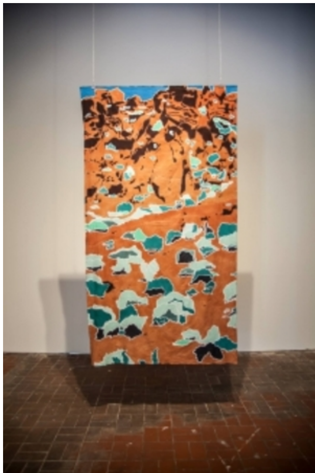
Claypan Soil, 2017 Batik, 224 bij 121 cm