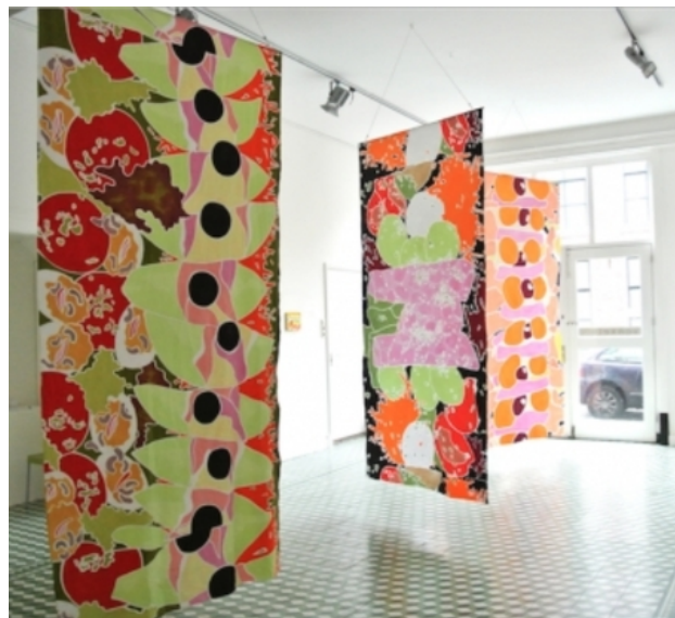
Devilled ducklings, 2017 Batik, 214 bij 113