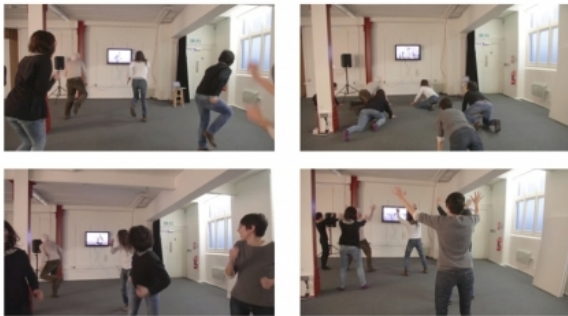
North by Northwest, 2014 Video