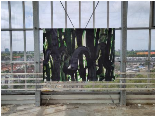
Untitled, 2024 mixed media on paper/installation, 150x200cm