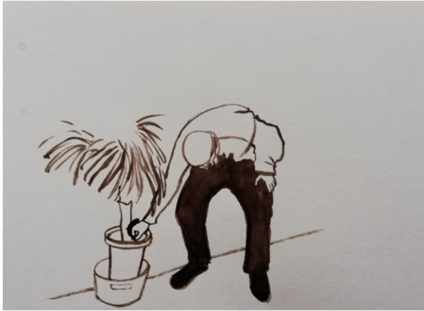
Burial, 2019 watercolour, A5