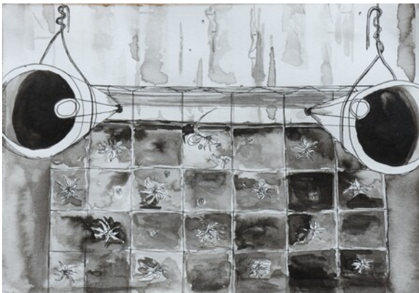
carnation cuttings, 2019 ink on paper, A5