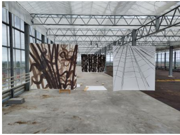
Resting Archive (working title), 2024 Mixed Media, ∞