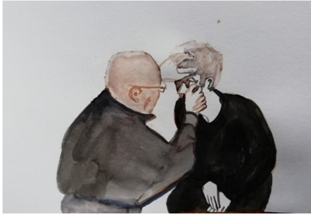
Therapy, 2019 watercolour, A5