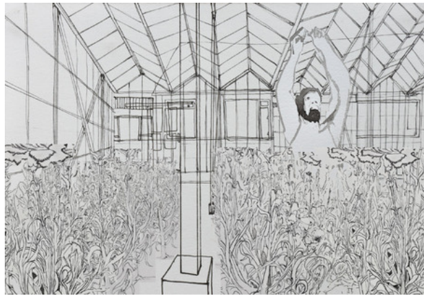
Untitled, 2020 ink on paper, collage, A5