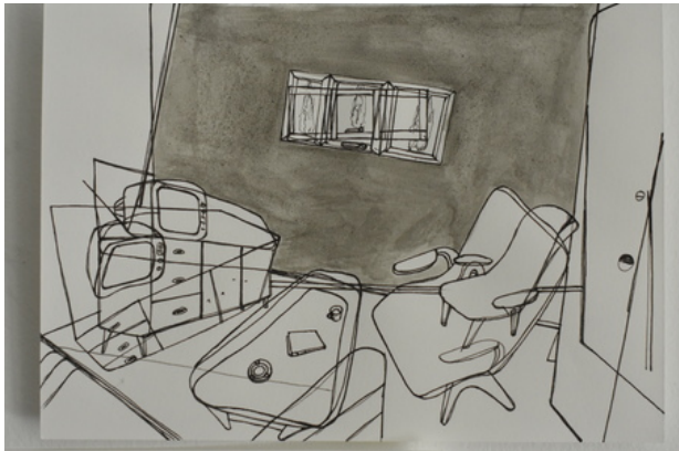
without title, 2018 ink on paper, A5