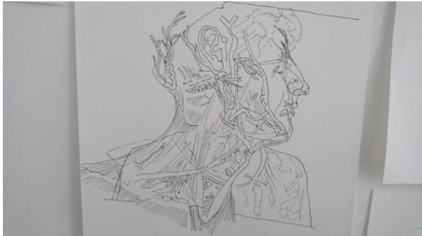
Mother I, 2018 ink on paper, A3