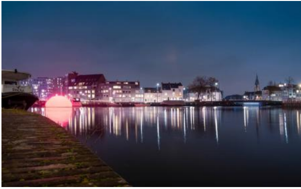
Sunset in Delft, 2021