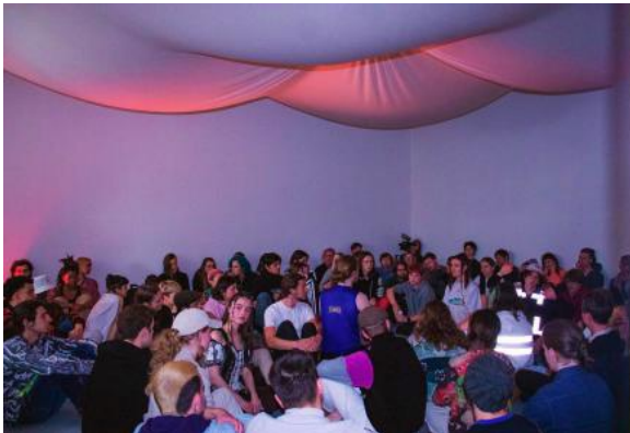
Home: An Unfinished Project, 2022