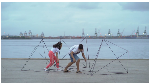
Polytope in Rio de Janeiro, 2023, 2023