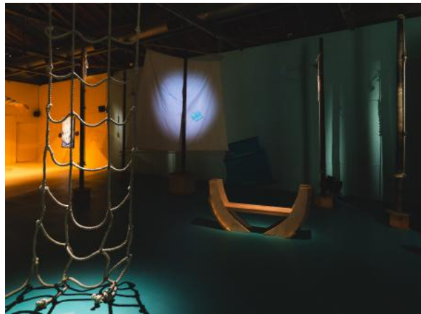
Holding the Wind in your Hands, 2024 mixed media, 12 m x 11 m x 4 m