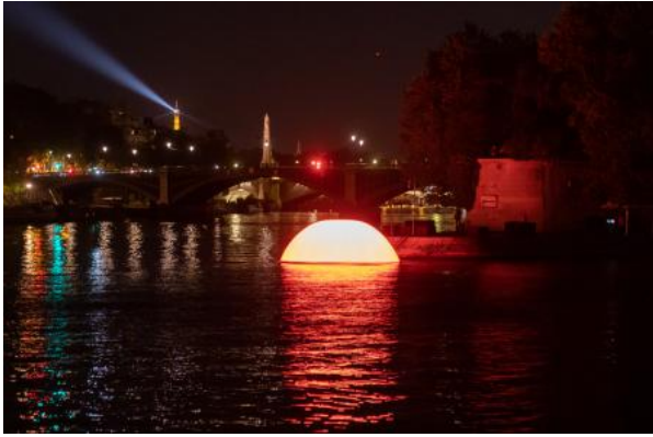
Sunset in Paris © Photo by Jean Baptiste Gurliat, 2023 inflatable, LED lights, water, dimensions vary according to the place