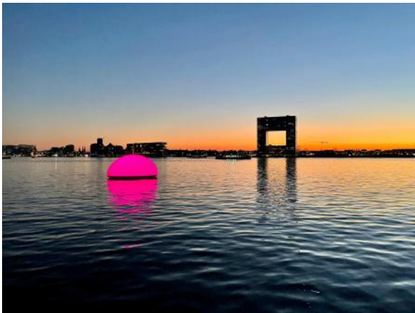
Sunset in Amsterdam, 2025 polyester, lights, ventilator, 8 m diameter

2013 - -- Cultural Organiser at CLOUD, platform for movement, The Hague