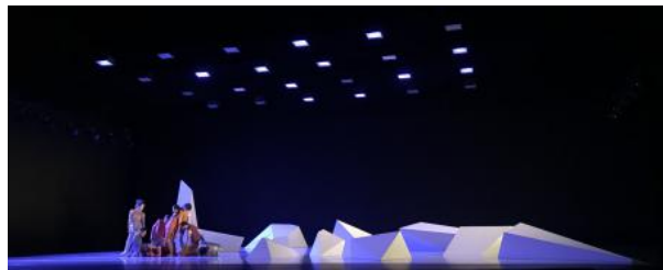
How to cope with a sunset when the horizon has been dismantled, 2022 3d modelling, CNC, wood, foam and rubber