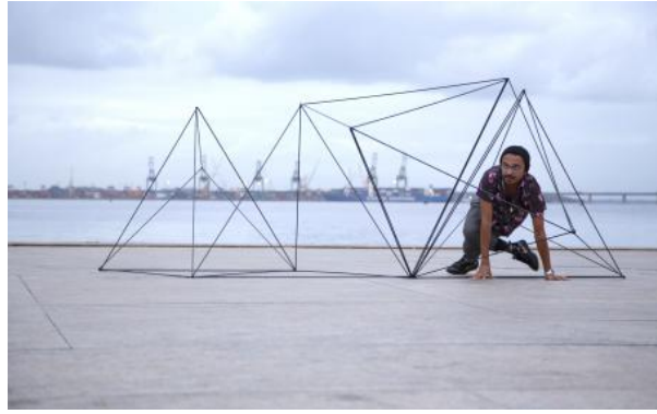
Polytope, 2023 carbon fiber, nylon chord, varied