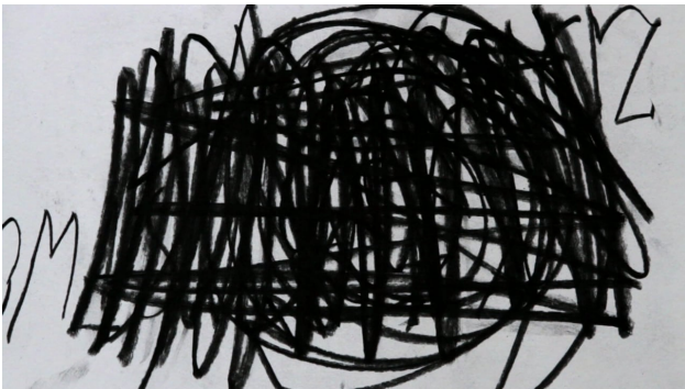
Trailer of 'We can't come from nothing', 2015 1:19