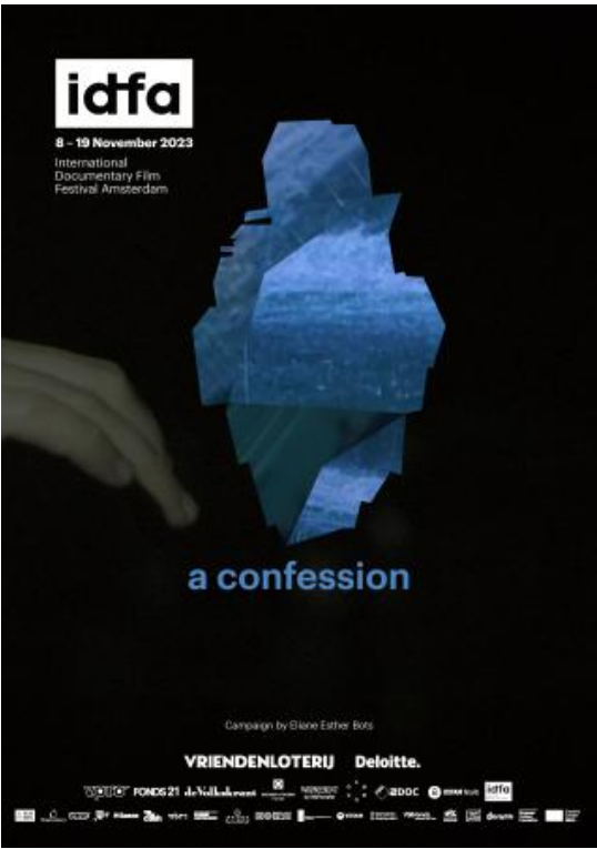
IDFA Campaign, 2023 film + audio + still photography + animation