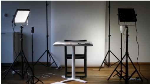
We can't come from nothing, 2015 Film