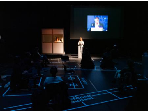
The Channel, 2020 performance, 38 minuten