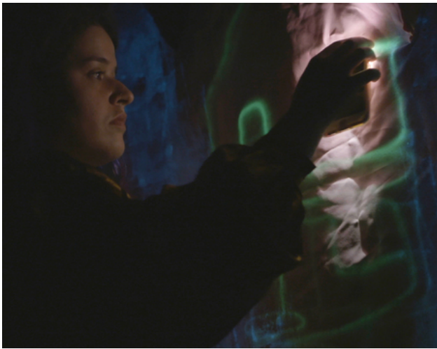
Cloud Forest, 2019