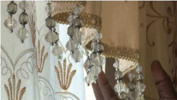
Trailer of 'The Brick House', 2017 00:57