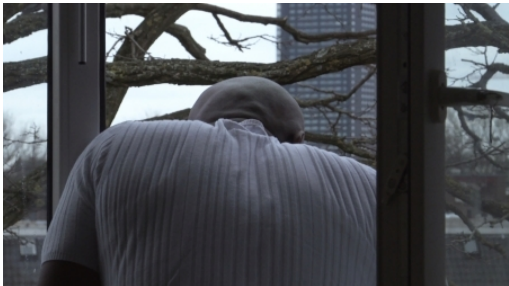
The Brick House, 2017 Film