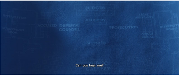
Trailer van 'In Flow of Words', 2021 1.27