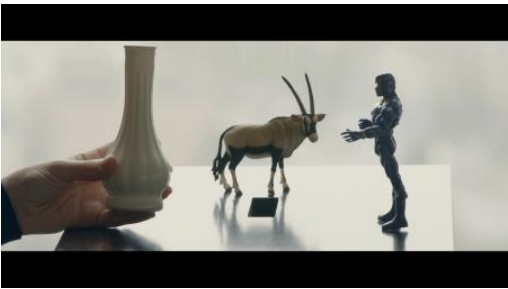
In Flow of Words, 2021 film, 22 minuten