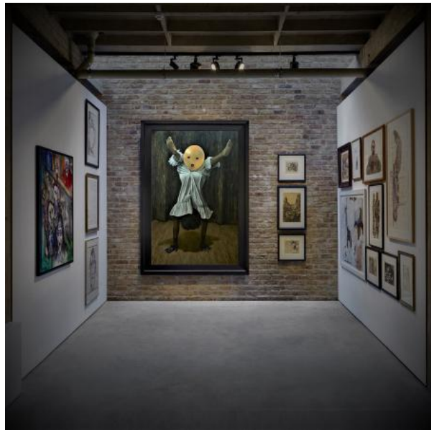
Metafoormorfose#15, 2022 olieverf op linnen met lijst, 222x152x7