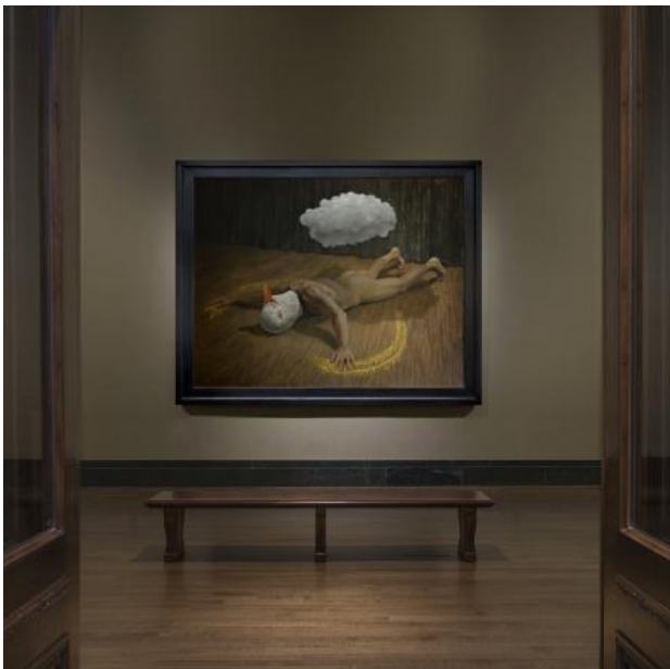
Metafoormorfose#17, 2024 olieverf op doek, 162x202x7