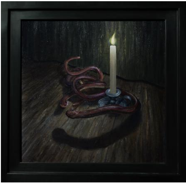
Metafoormorfose#19, 2025 olieverf op doek met lijst, 57x57