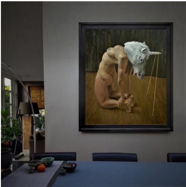
Metafoormorfose#14, 2022 olieverf op linnen met lijst, 162x142x7