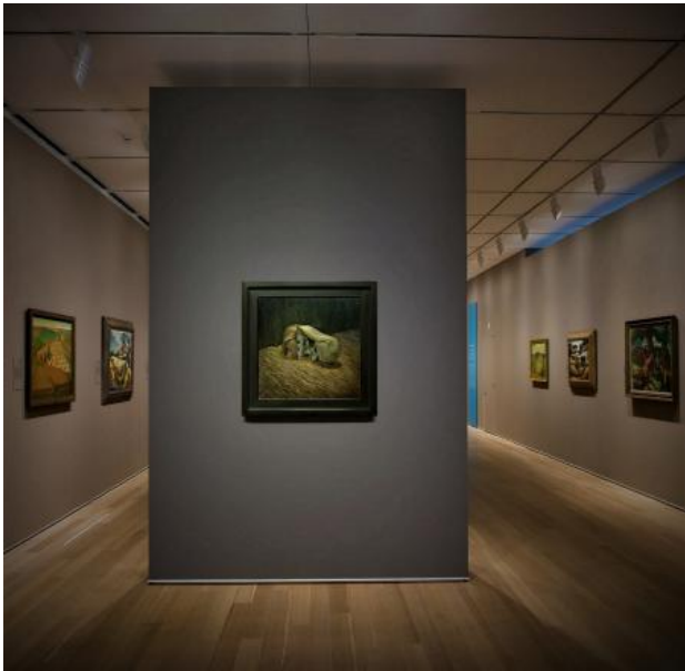
Metafoormorfose#16, 2022 olieverf op linnen met lijst, 78x78x6