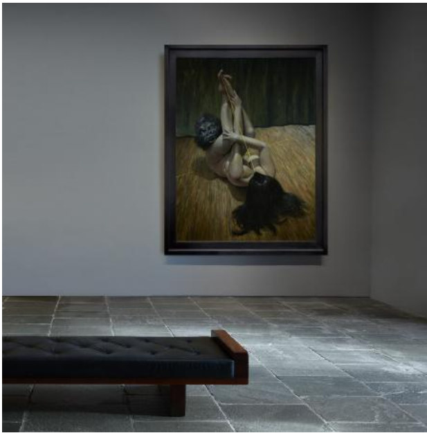
Metafoormorfose#13, 2021 olieverf op doek met lijst, 182x142x7