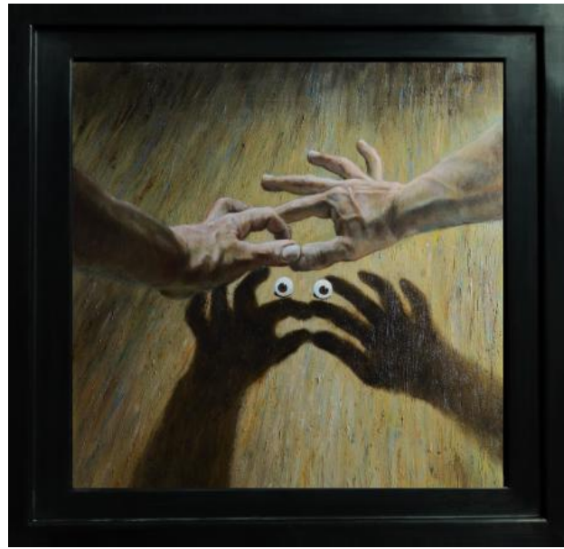
Metafoormorfose#18, 2025 olieverf op doek met lijst, 57x57