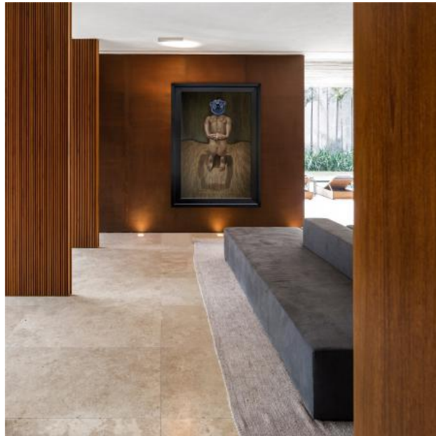
Metafoormorfose#12, 2021 olieverf op linnen met lijst, 202x142x7