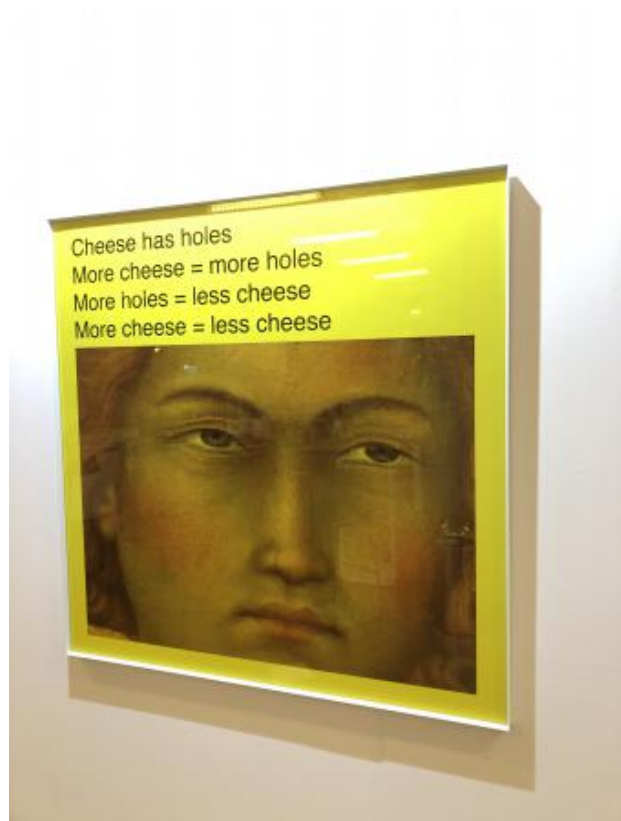
cheese, 2020 ingelijste foto met geel plexiglas, 100 x 100 cm