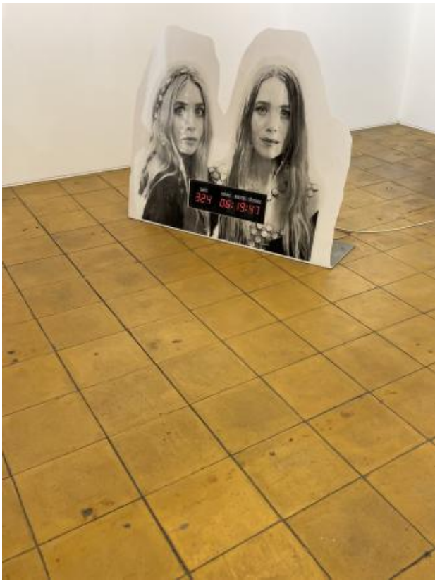
new me me, 2023