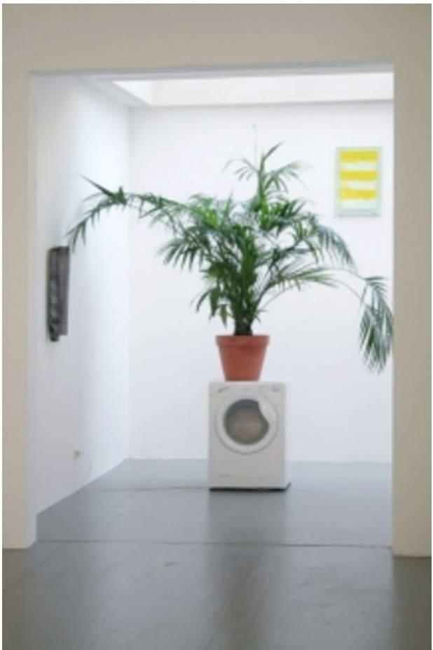
Oh?!, 2014 was machine met plant, variabel