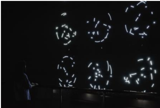
Red Horizon, 2025 kinetic, sound, light installation