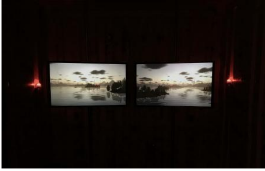
Flowing Grounds | Stockholm, 2022 Installation - 2 channel video, multichannel audio, tactile transducers, signal lights