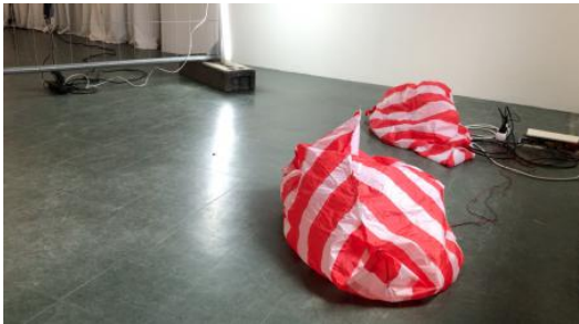
Symbiotic Spaces | Stockholm, 2021