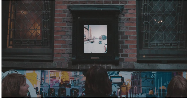
Vec4(red,green,blue,alpha), 2024 02:56