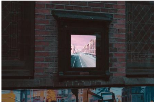
Vec4(red,green,blue,alpha), 2024 Generatieve virtuele 3D omgeving op scherm, 41 x 33 x 4 cm