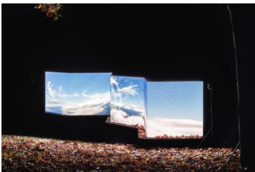
Airborne Landscapes, 2022