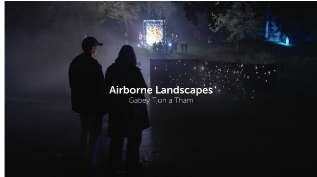
Airborne Landscapes, 2022 02:14