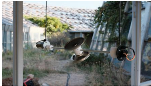
The Monads, 2025 kinetic, sound installation